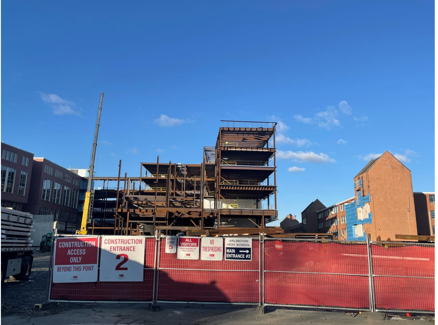
Photograph 1: Phase 2 East Elevation (Mill Brook Dr)