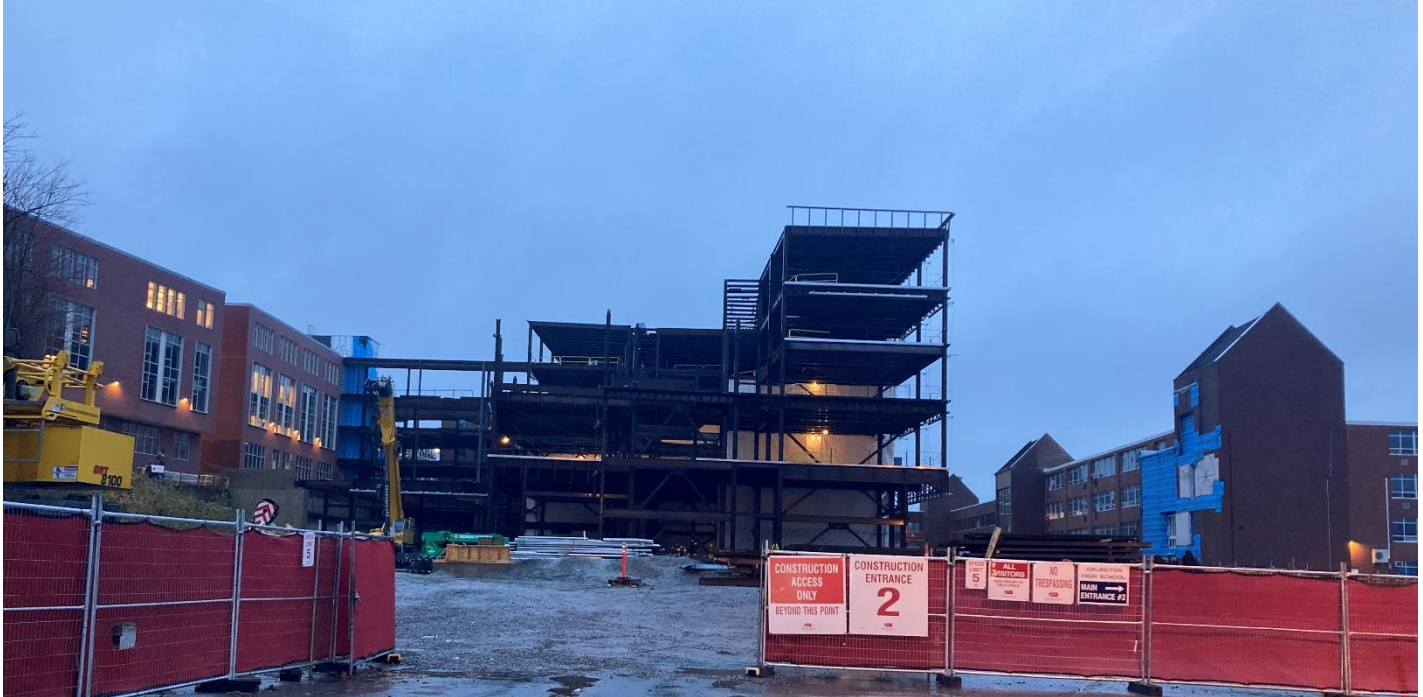
Photograph 1: Phase 2 East Elevation (View from Mill Brook Drive) Taken Week of 12/7/2022