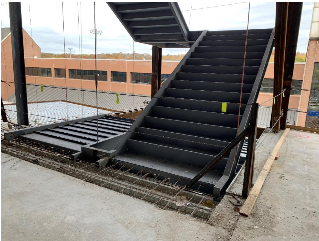
Photograph 2: Stair 1 Progress