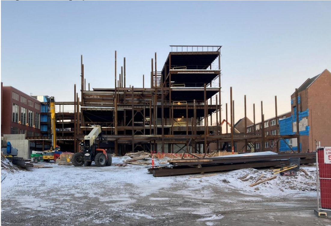
Photograph 1: Phase 2 East Elevation (View from Mill Brook Drive) Taken Week of 12/14/2022