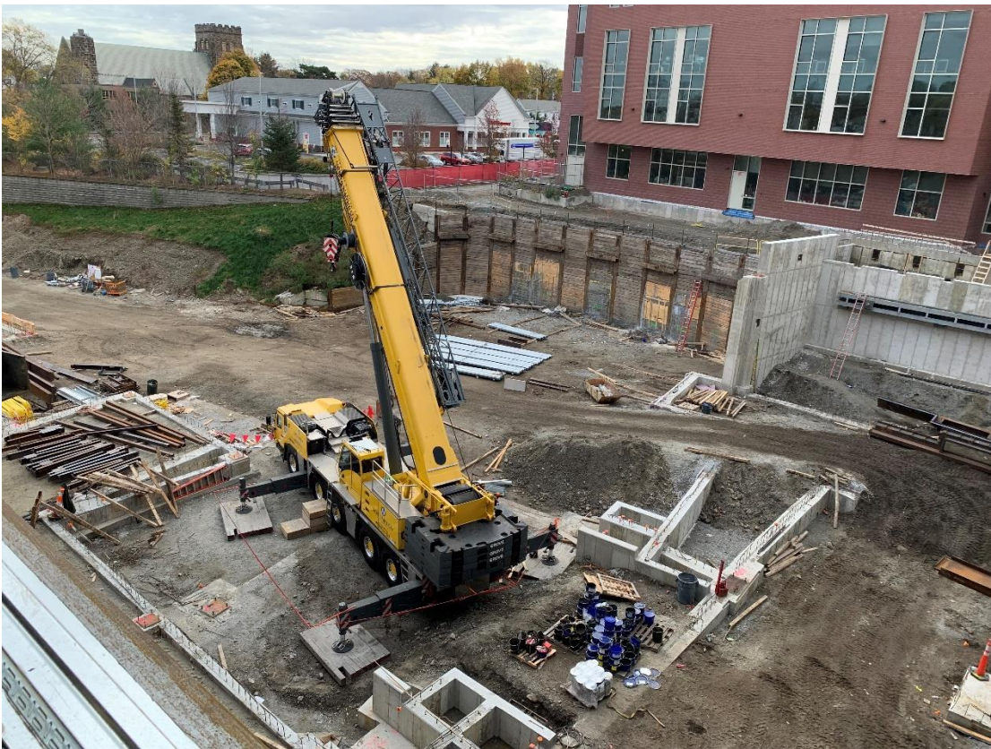
Photograph 2: Future loading dock