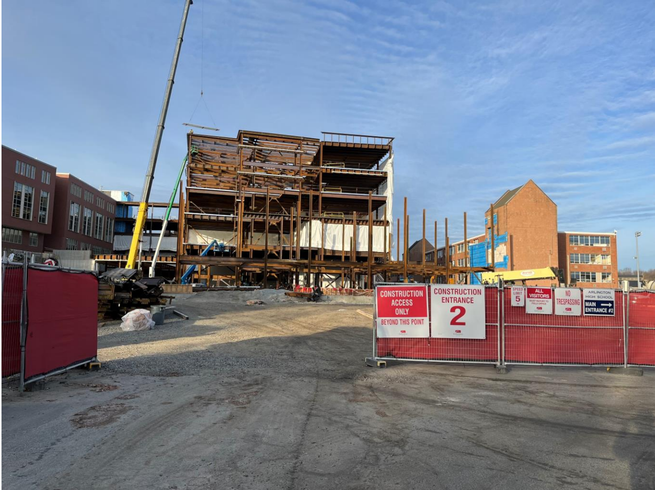
Photograph 1: Phase 2 East Elevation (View from Mill Brook Drive) Taken 12/22/2022