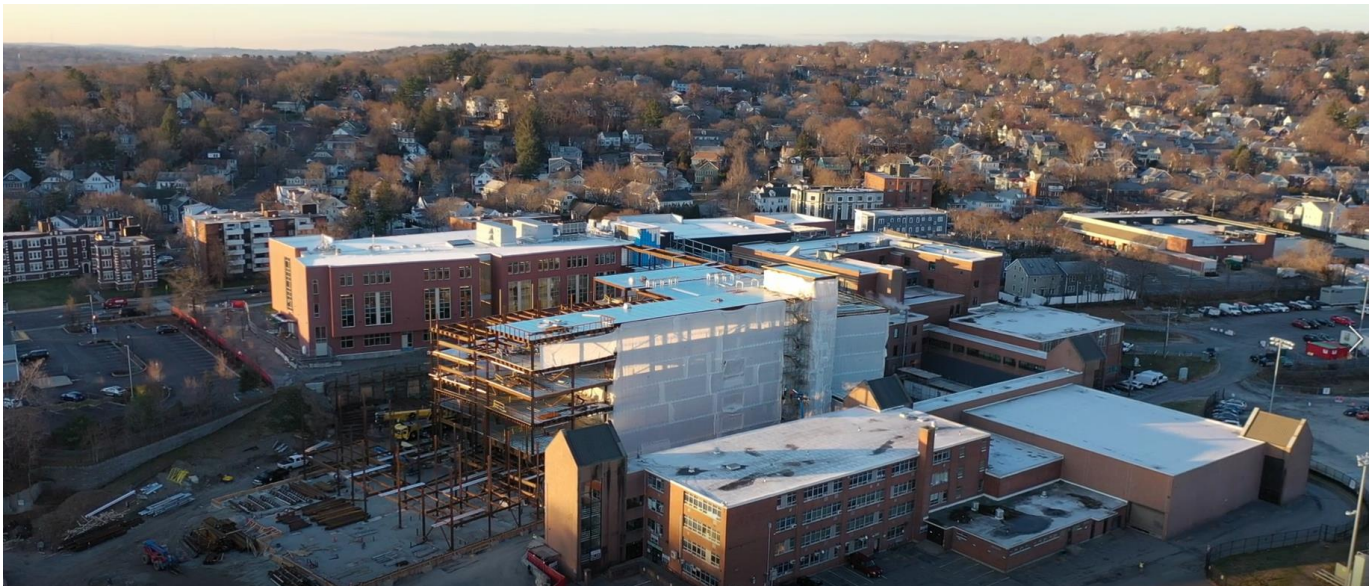
Photograph 2: From drone footage. Taken week of 12/19/22