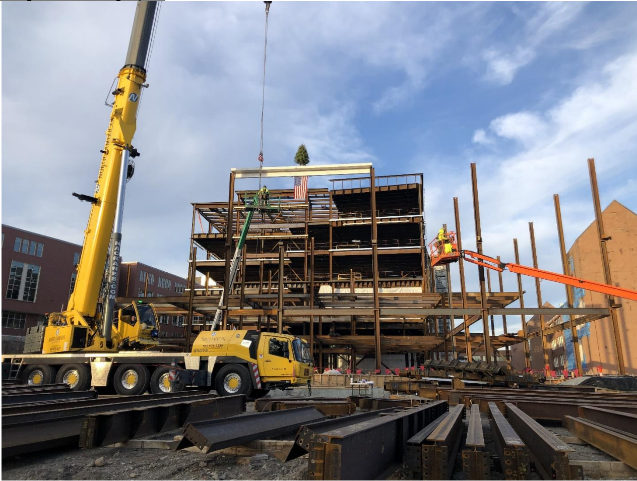
Photograph 1: Phase 2 East Elevation (View from Mill Brook Drive). Taken 12/29/2022. At the top center is the topping off steel beam with the evergreen tree and flag.