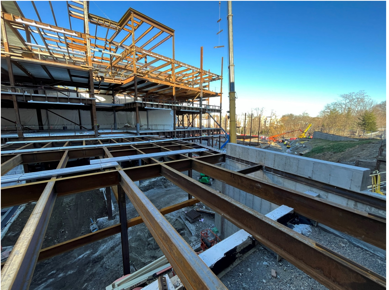
Photograph 3: Phase 2 Progress

WEEKLY UPDATE – WEEK OF JANUARY 16 TH , 2023