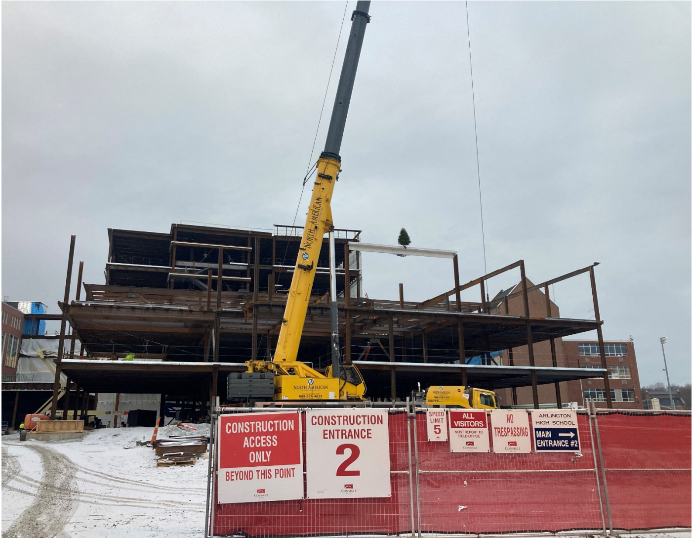
Photograph 1: Phase 2 East Elevation (View from Mill Brook Dr). At the top center is the topping off steel beam with evergreen tree and flag.