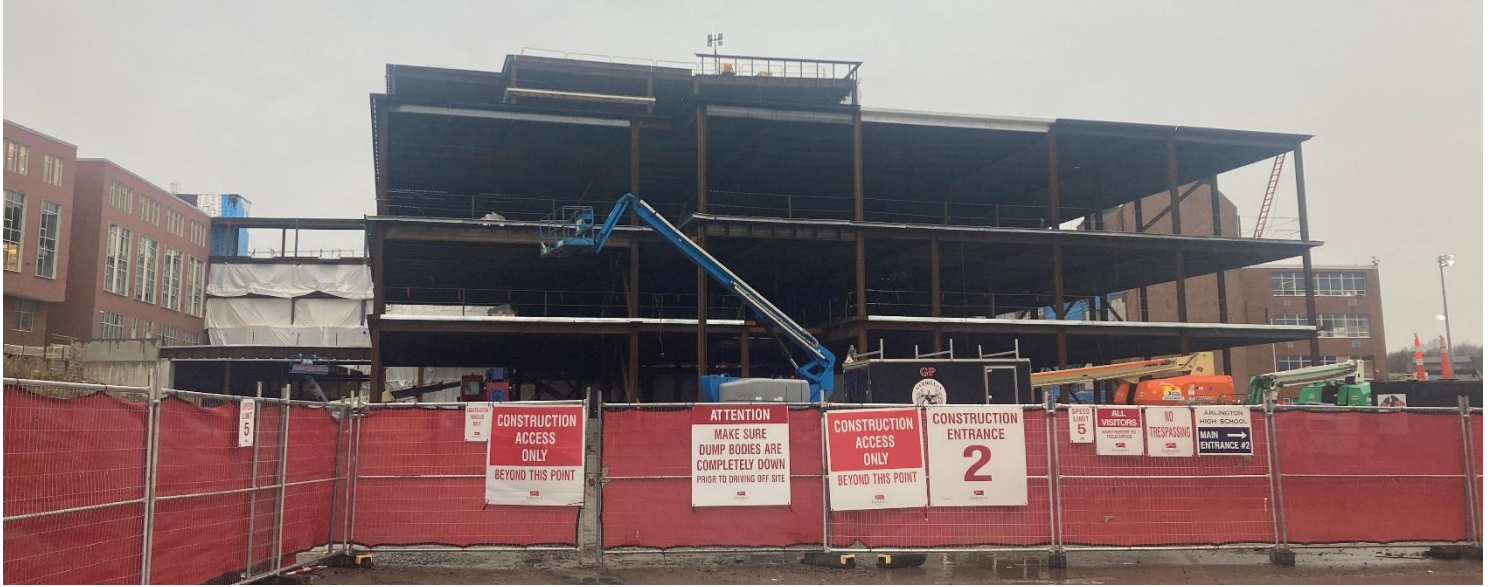
Photograph 1: Phase 2 East Elevation (Mill Brook Dr)