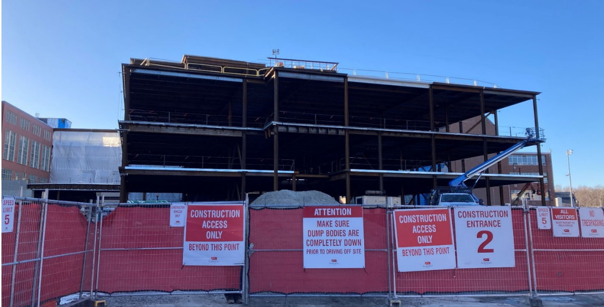
Photograph 1: Phase 2 East Elevation (Mill Brook Dr)