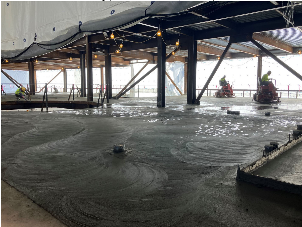
Photograph 2: Concrete placement in progress