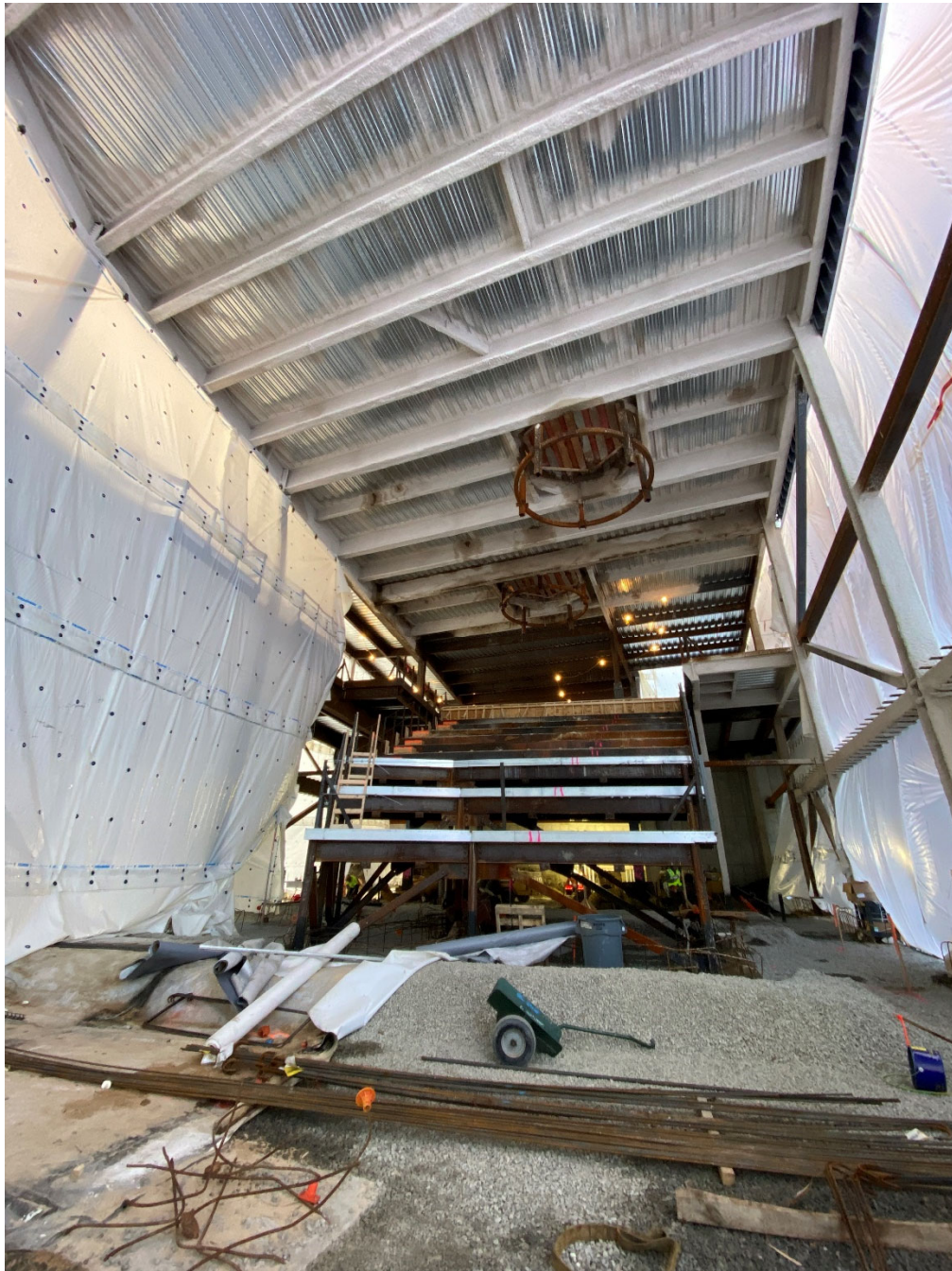
Photograph 3: Central Spine Forum Stair Progress

WEEKLY UPDATE – WEEK OF FEBRUARY 6 TH , 2023