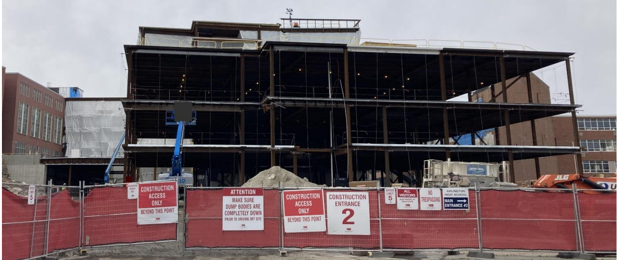
Photograph 1: Phase 2 East Elevation (Mill Brook Dr). Photo taken 2/9/23