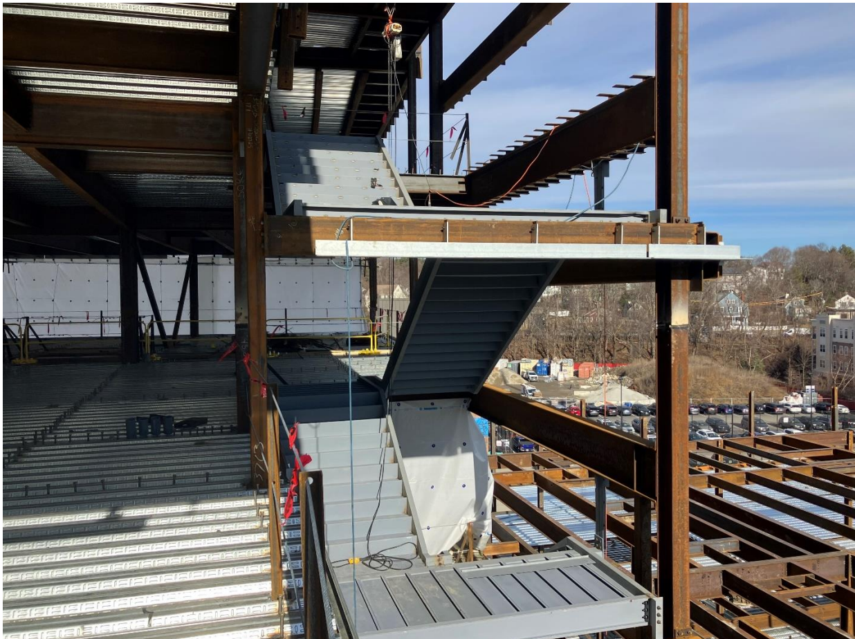
Photograph 2: Stairwell #4 in progress