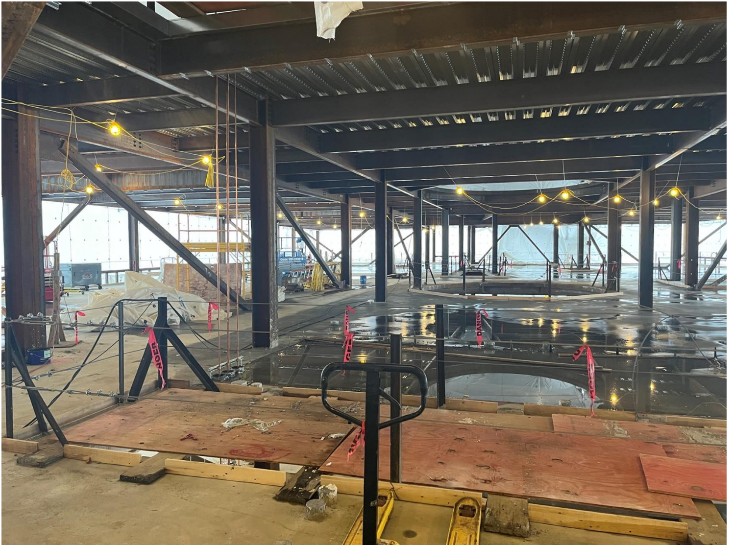
Photograph 3: Classrooms Wing in Progress