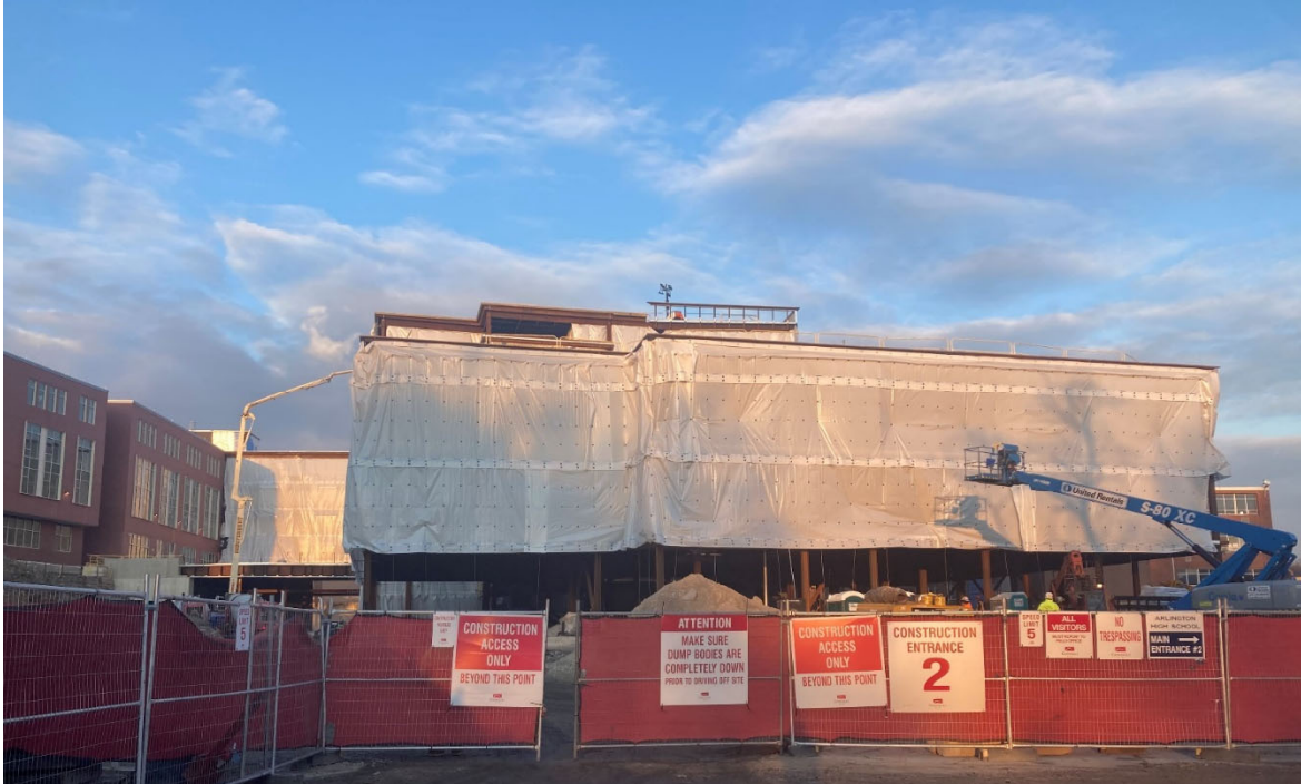
Photograph 1: Phase 2 East Elevation (Mill Brook Dr)