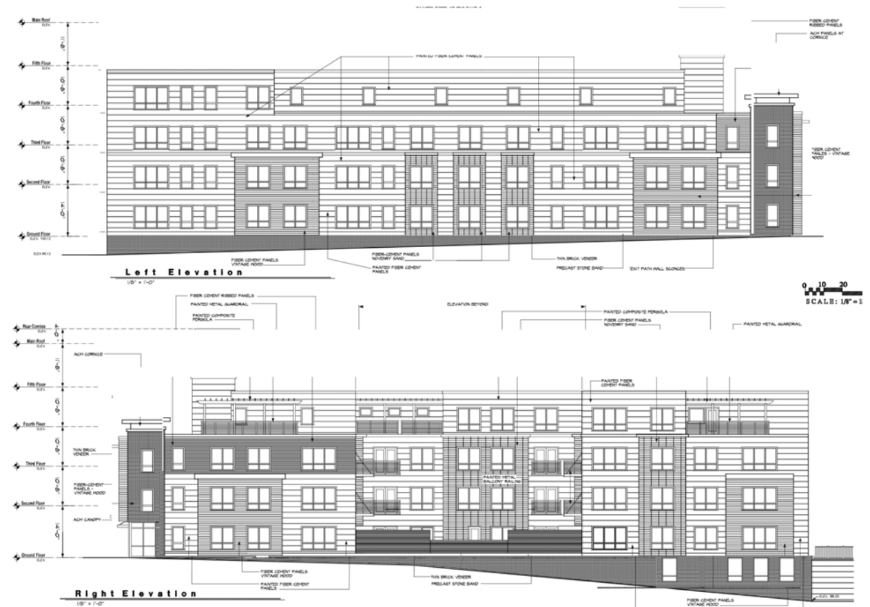
Below- Revised Plan - 4 Stories with Garage Underground