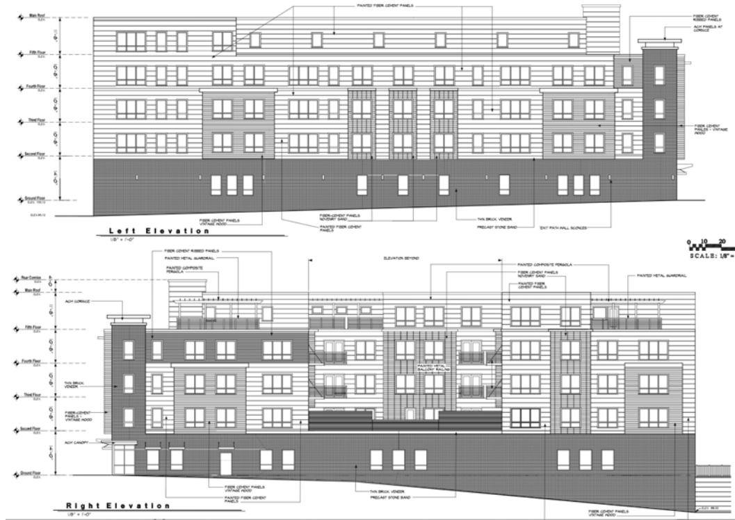
Above - Current Plan - 5 Stories

Below are the Side Elevations at 5 stories and with the garage underground and the top floor floors lowered to street level.