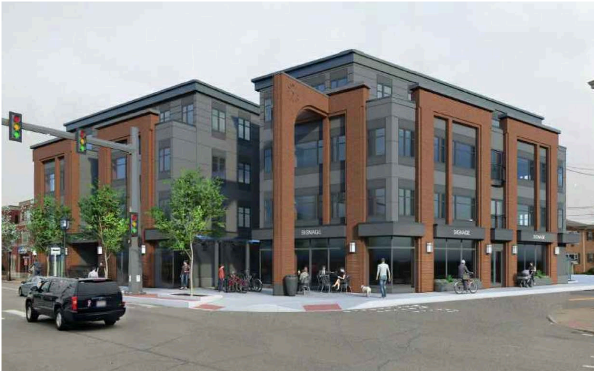
1021-1025 Mass Av

The proposed 190-200 Mass Av has 4 stories with the top one set back. See below. This is what 1021-1025 Mass Av could look like if the garage is put underground.