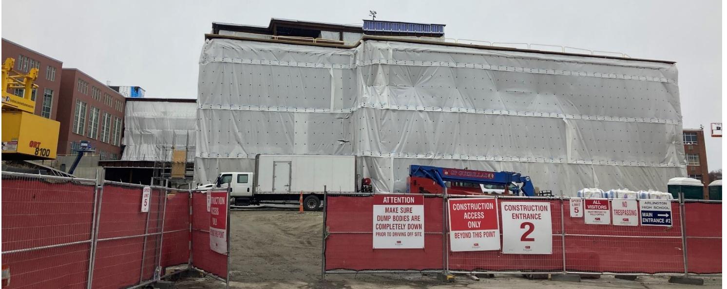
Photograph 1: Phase 2 East Elevation (Mill Brook Dr)