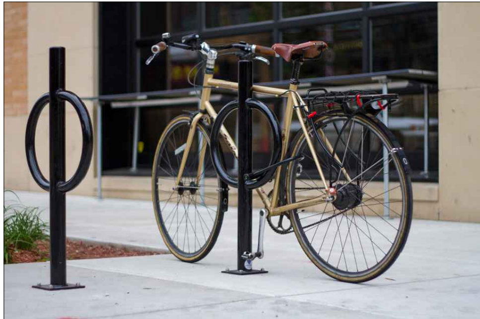
BICYCLE HITCH POST