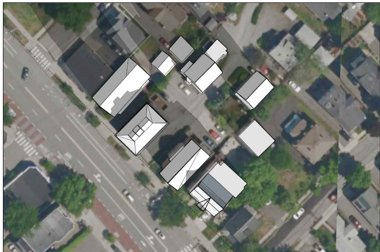
WINTER SOLSTICE - AM