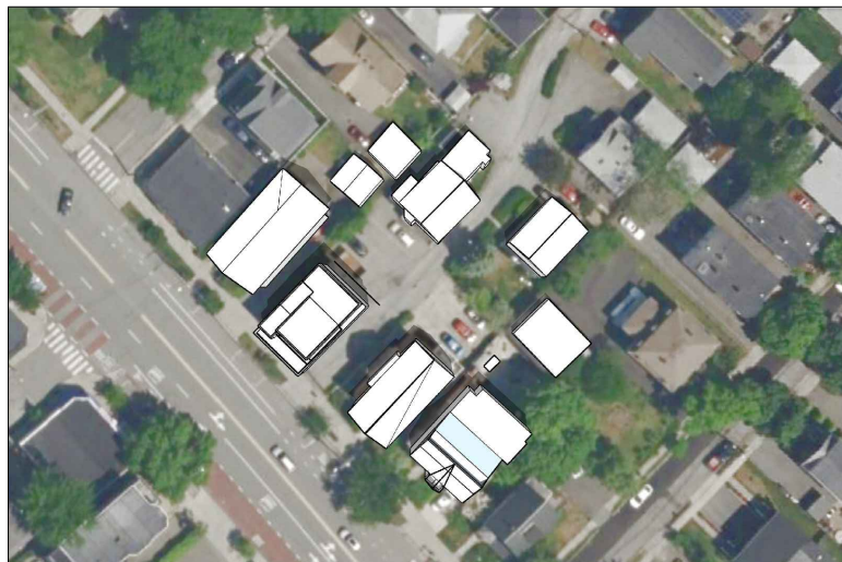
SUMMER SOLSTICE - NOON