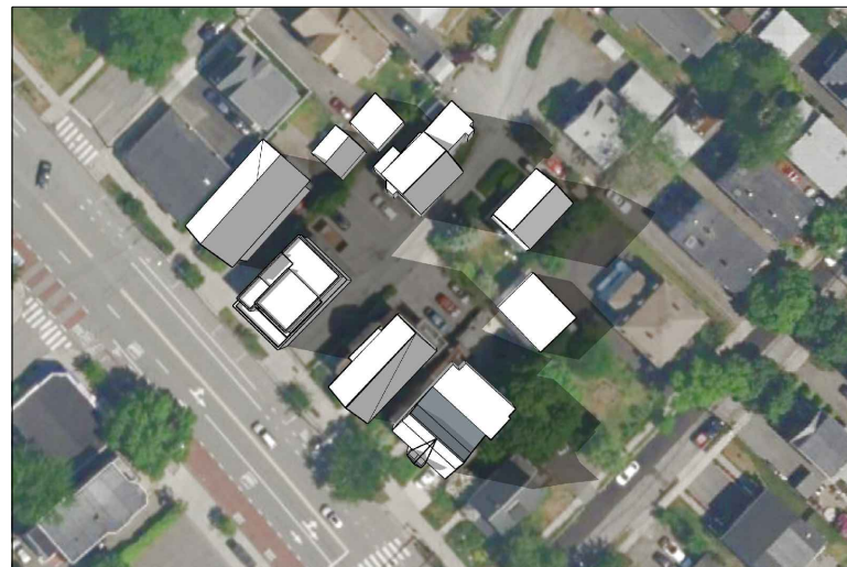
SUMMER SOLSTICE - PM

Project Title: 99 Mass Ave Arlington, MA