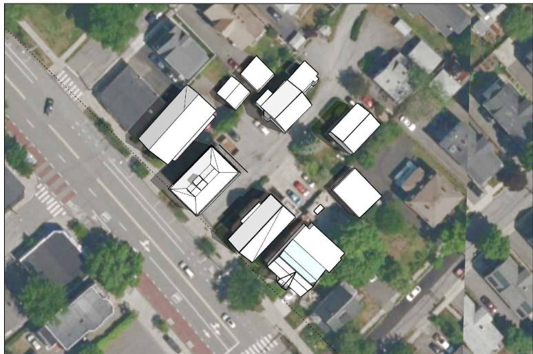
SUMMER SOLSTICE - AM