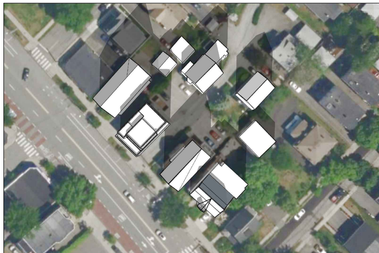
WINTER SOLSTICE - NOON

Project Title: 99 Mass Ave Arlington, MA