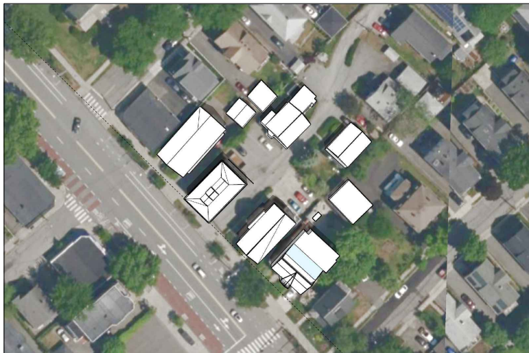
SUMMER SOLSTICE - NOON