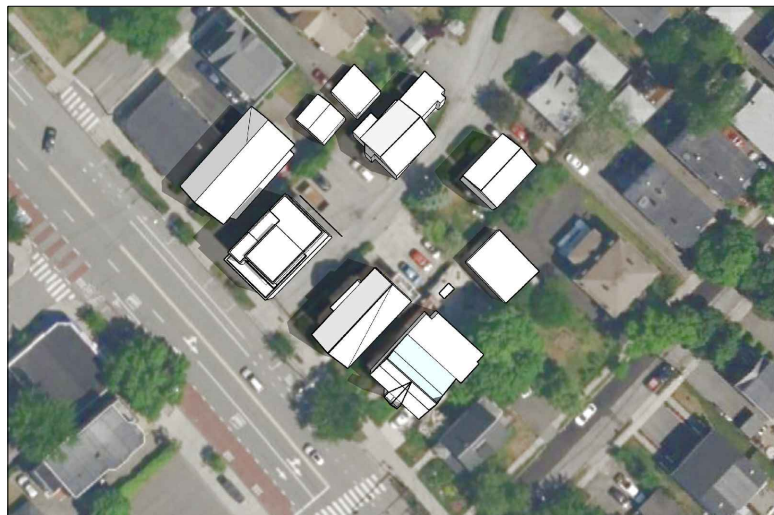
SUMMER SOLSTICE - AM