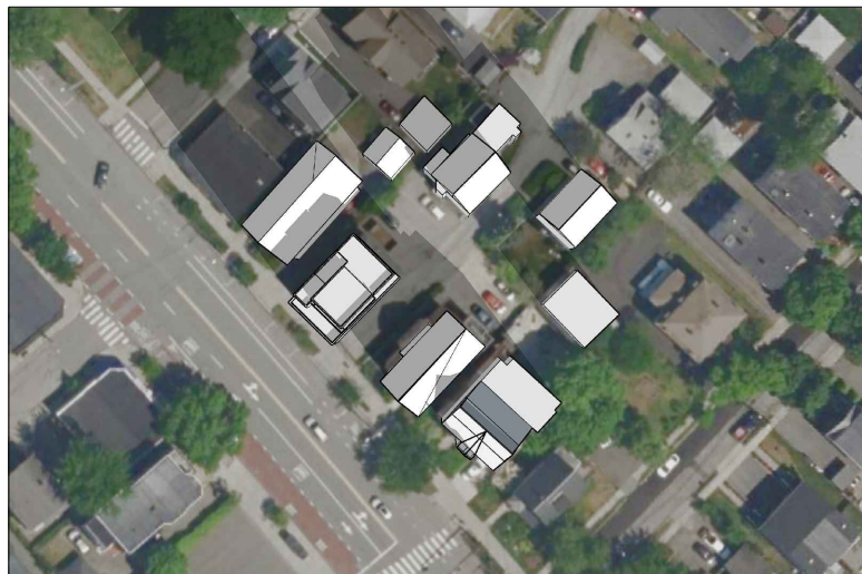
WINTER SOLSTICE - AM