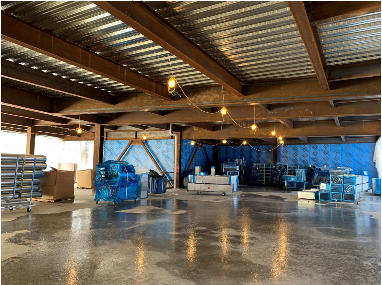
Photograph 2: Phase 2 Concrete Progress