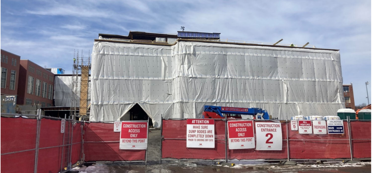
Photograph 1: Phase 2 East Elevation (Mill Brook Dr)