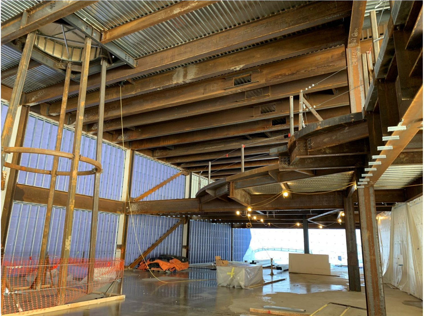
Photograph 3: Phase 2 Lightwell Framing

WEEKLY UPDATE – WEEK OF MARCH 6 TH , 2023