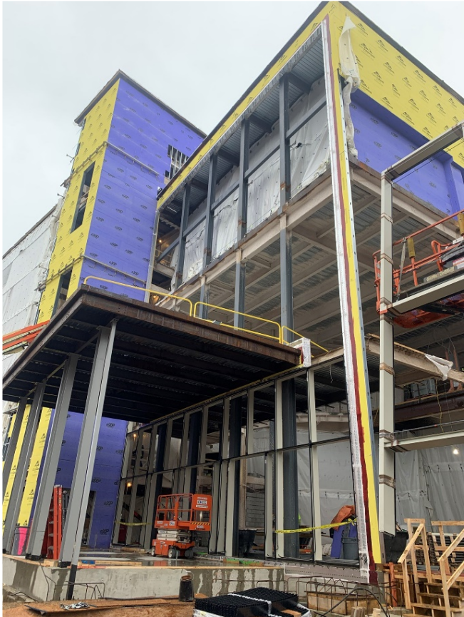
Progress of Main Entrance