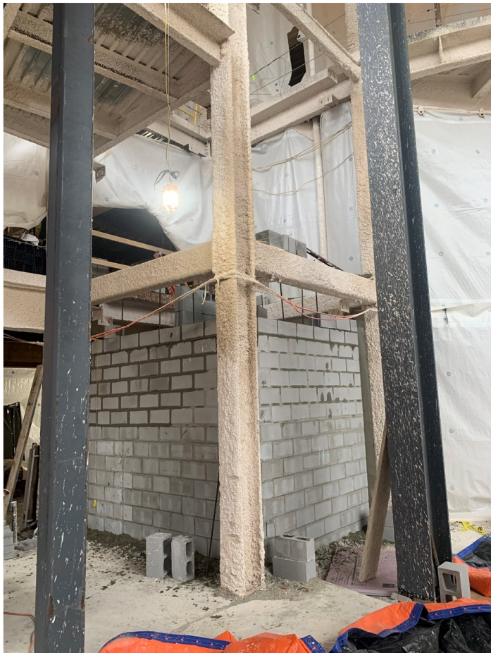
Progress of elevator shaft