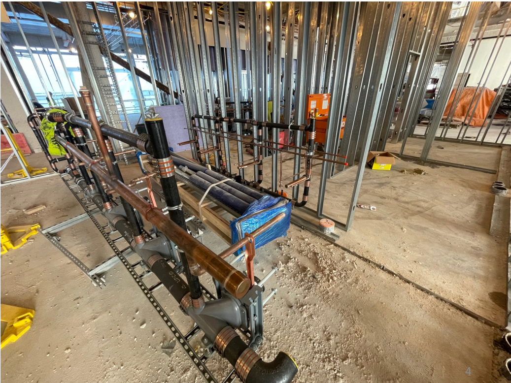
Piping for bathroom fixtures getting assembled