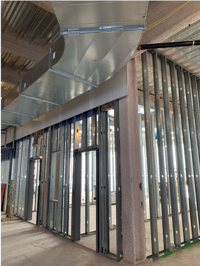
Progress of interior framing and overhead mechanical and fire sprinkler