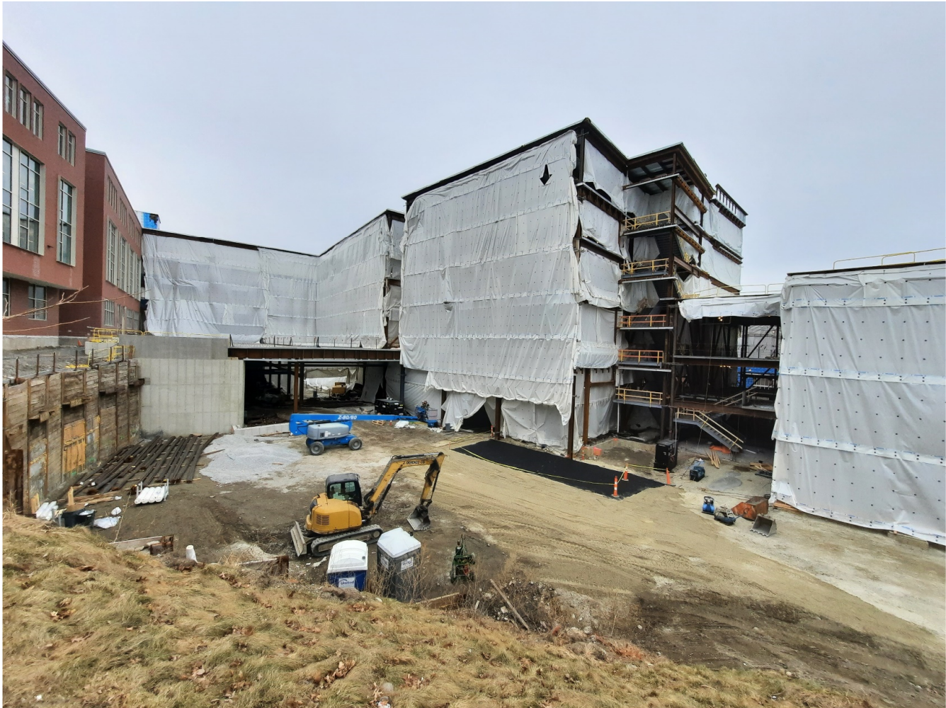
View of connector from Building D to Building B, Building B and partial of Building C