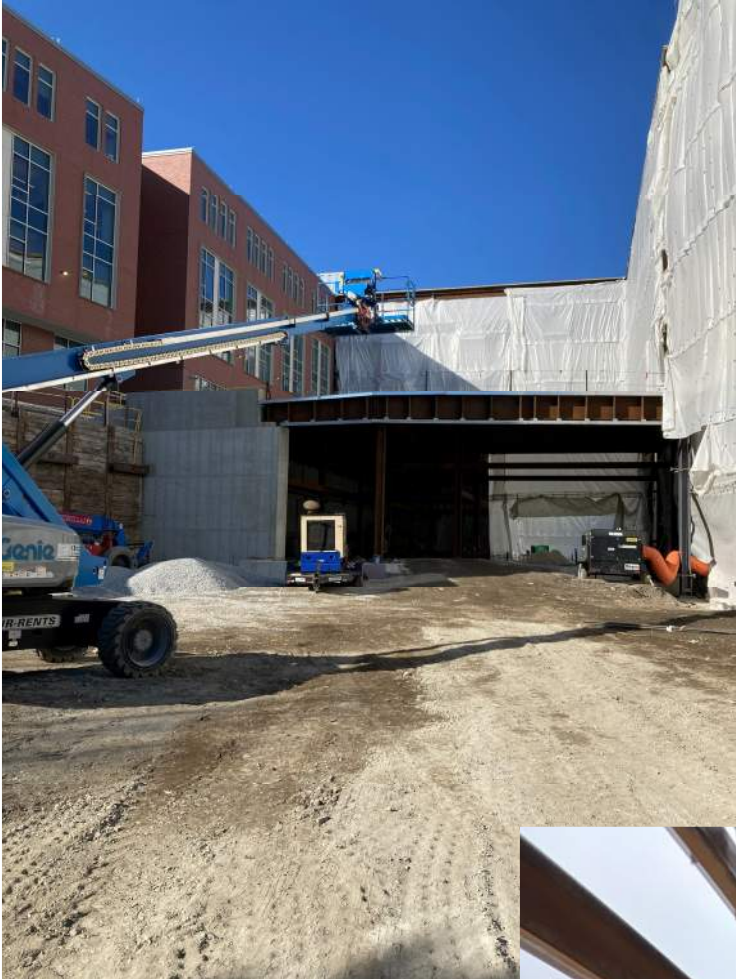
Connector between Building D and Building B