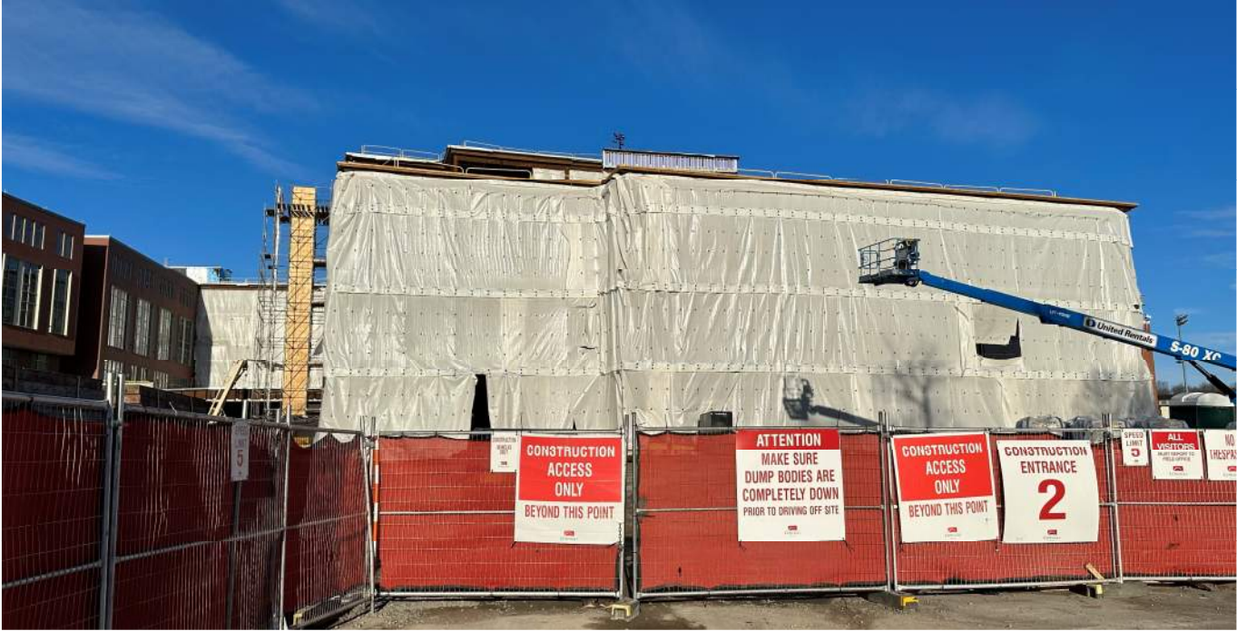
Phase 2 East Elevation (Mill Brook Dr.)