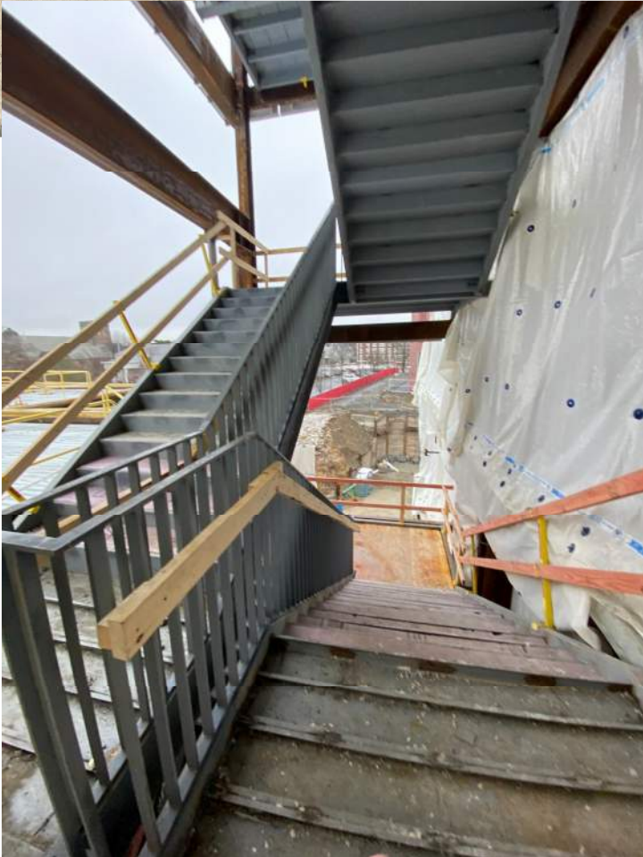
Stairwell #4 (Southeast Building B)