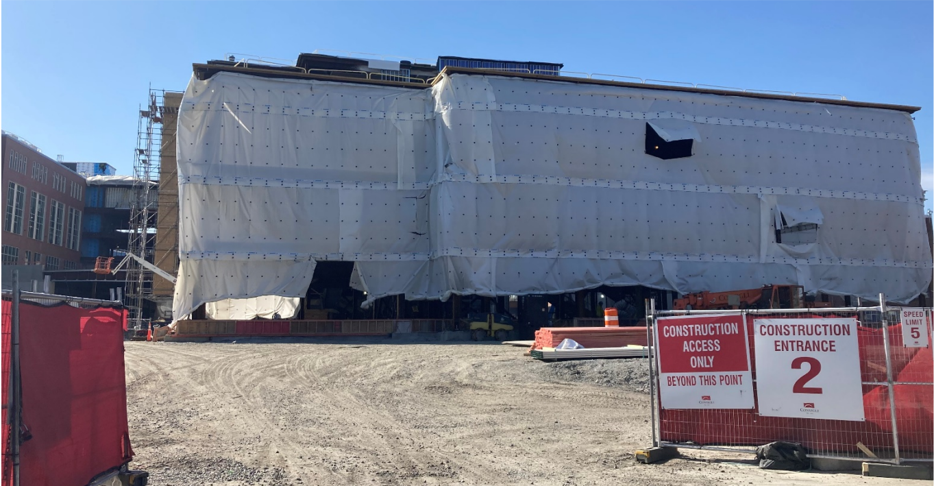
Phase 2 East Elevation (Mill Brook Dr.)