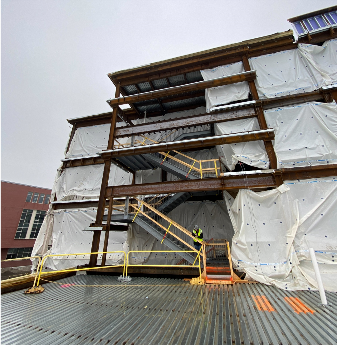
Roof decking of the District office and Stairwell #4