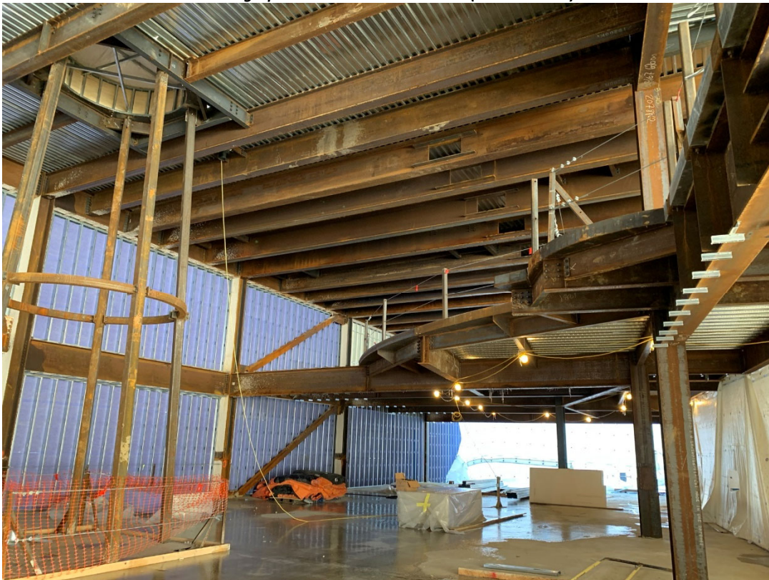
Photograph 2: Media Center & Lightwell Progress