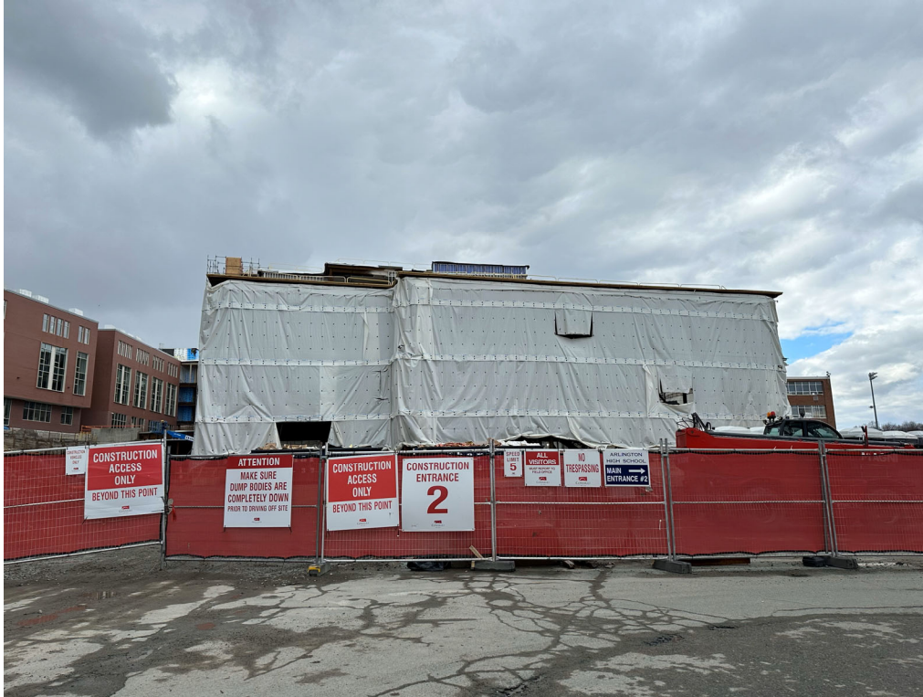
Photograph 1: Phase 2 East Elevation (Mill Brook Dr)