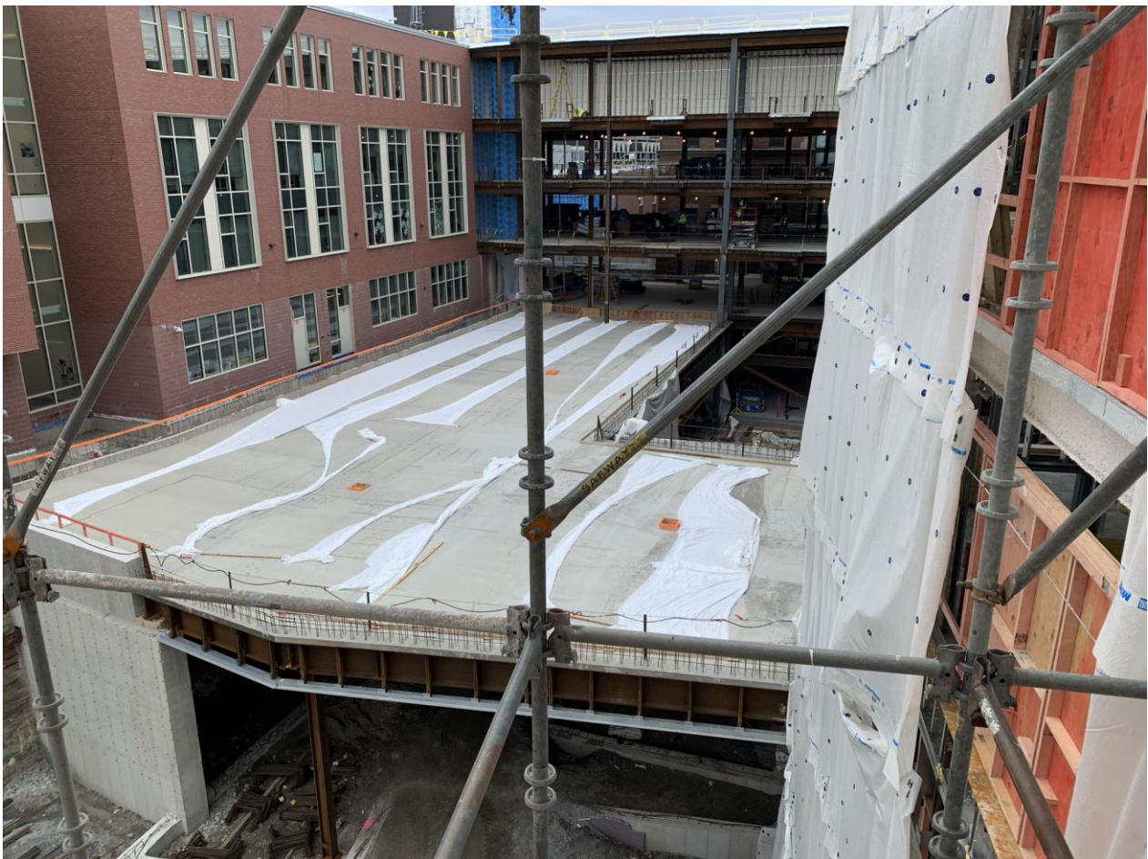
Concrete placed for courtyard Framing progress of connecting corridors from Phase 1 Building to Phase 2 Building