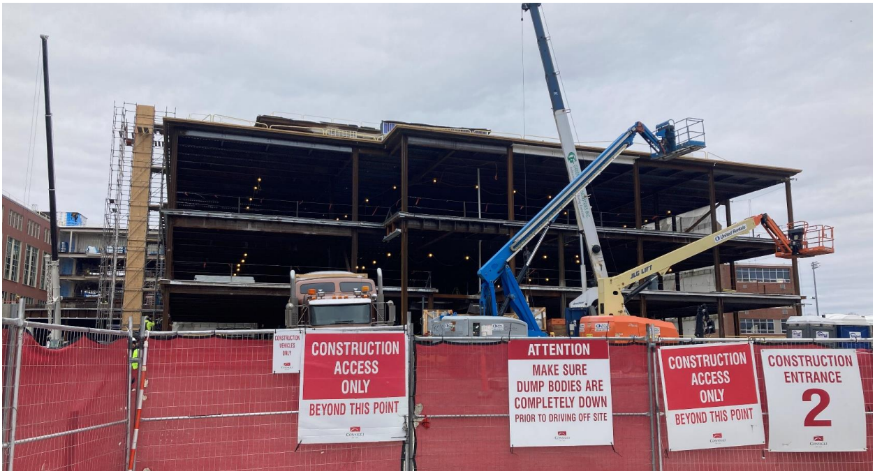
Phase 2 East Elevation (Mill Brook Dr.)