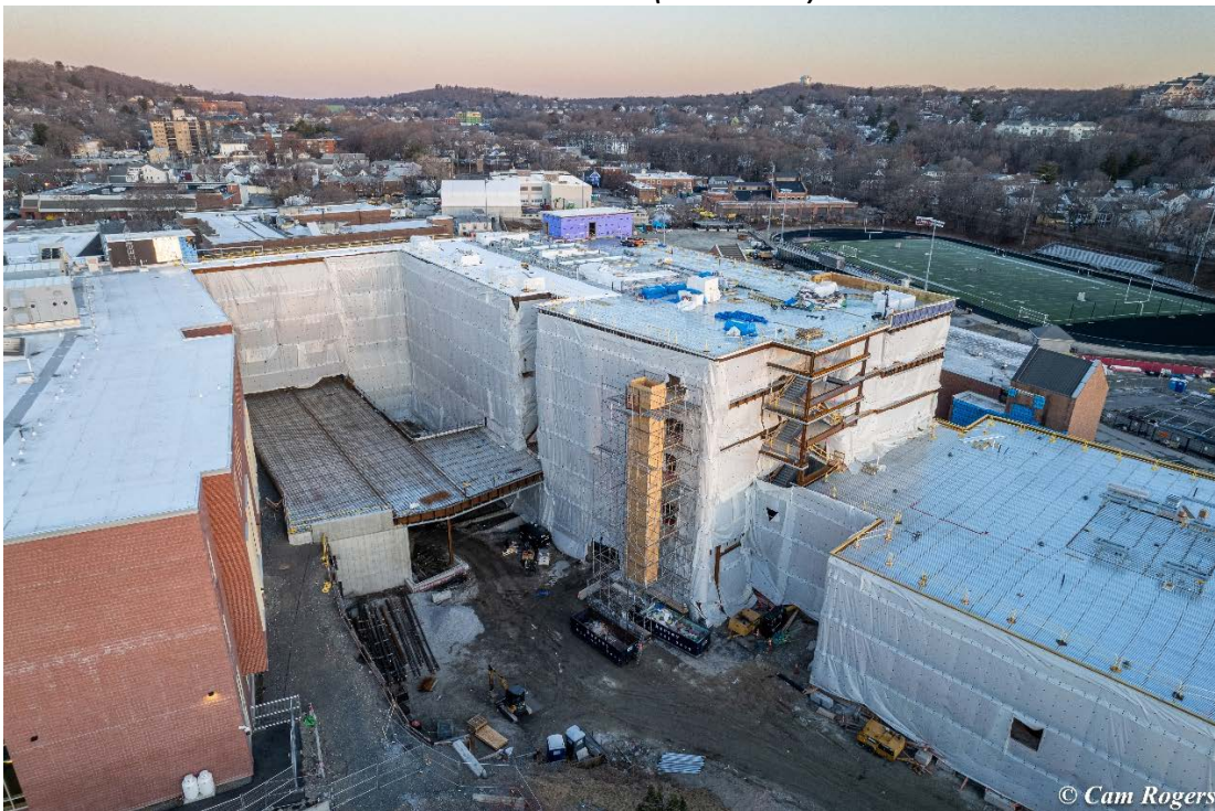
Phase 2 Progress – Drone Image