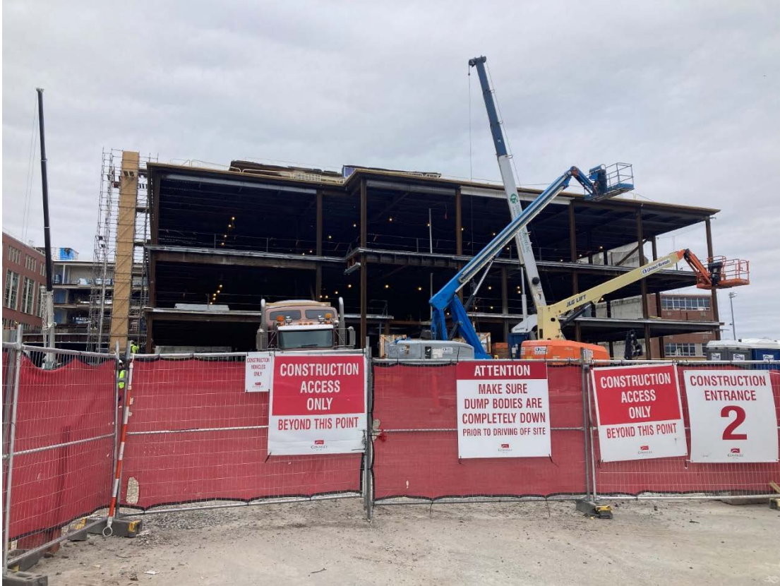
Phase 2 East Elevation (Mill Brook Dr)