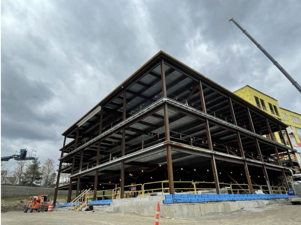
Phase 2 East Elevation (Millbrook Dr)