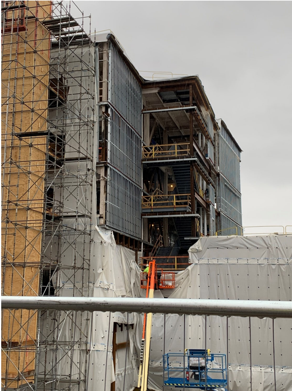
Main Entrance #2 Curtain Wall Progress