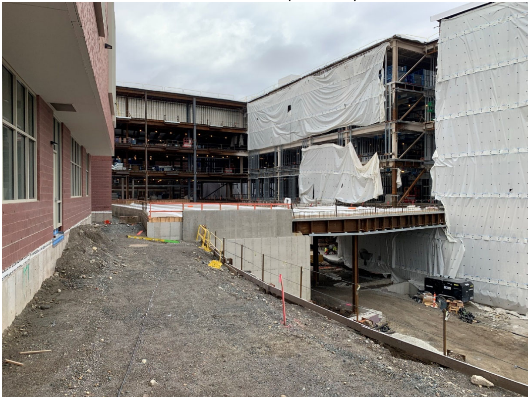
Phase 2 & Phase 1 connection and outdoor courtyard progress