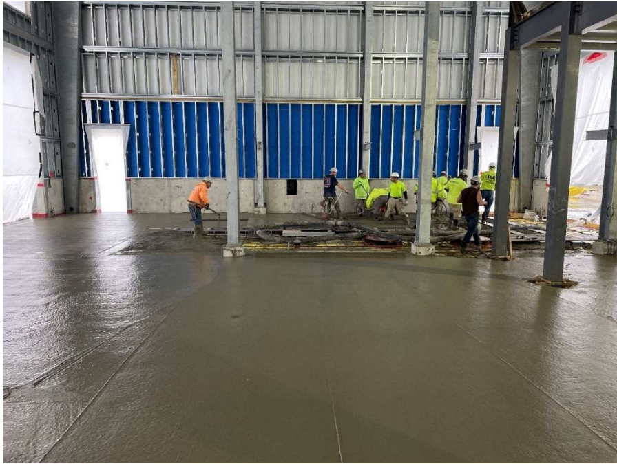
Building E pouring of concrete floor slab