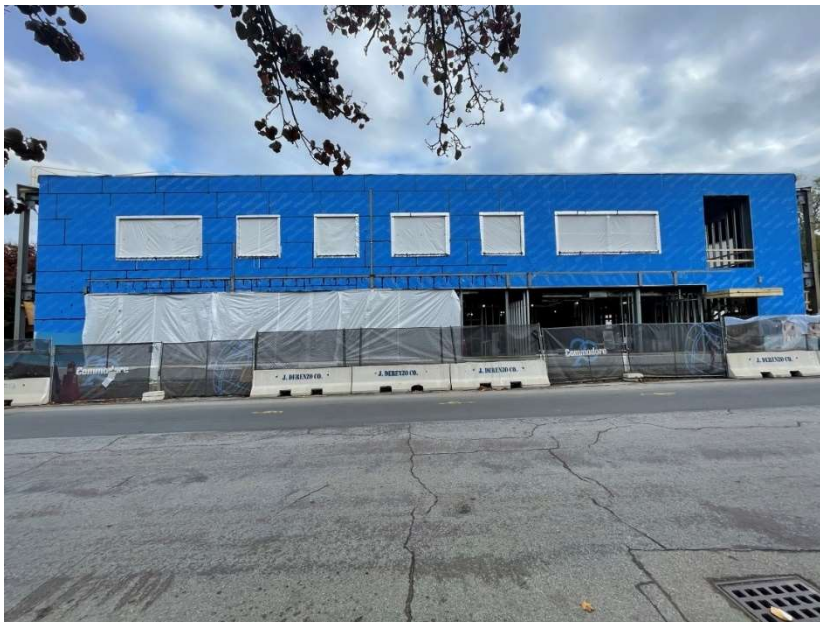
Building E exterior from Grove Street – finished exterior will be terracotta tile