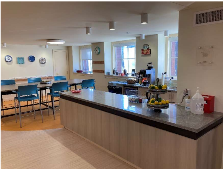
Café – ground floor