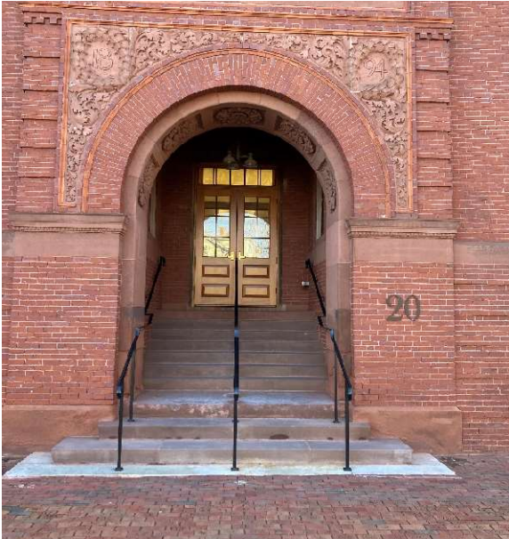
Academy Street entrance – new stairs, doorway