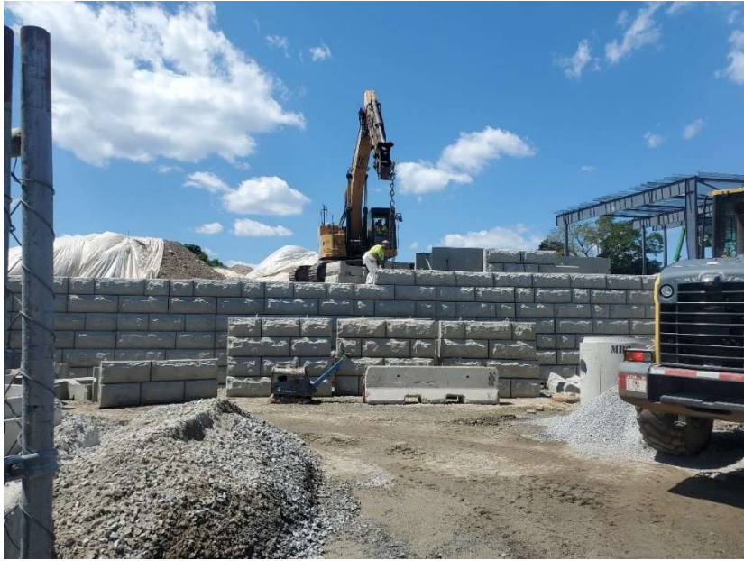
Construction of retaining wall