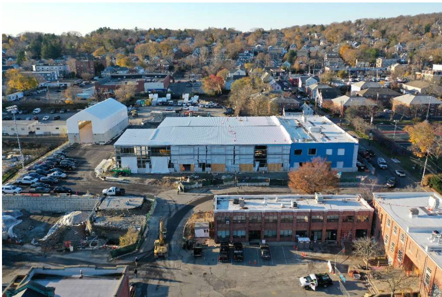
Site overview showing completed Salt Shed in upper left, enclosed new Building E, and historic Buildings A and B in lower right