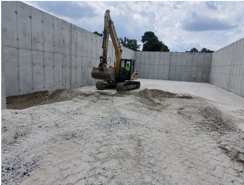
Preparation of Salt Shed floor