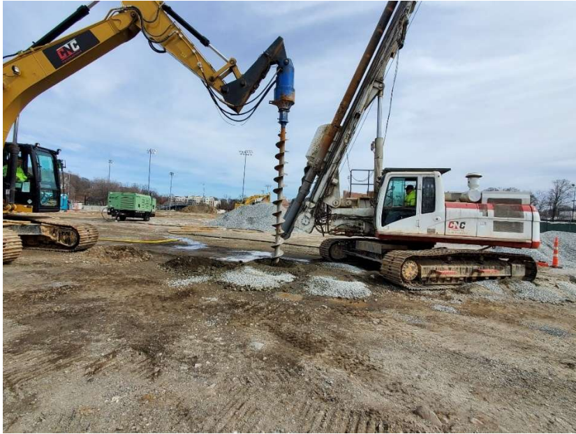
Site work – drilling exploratory holes