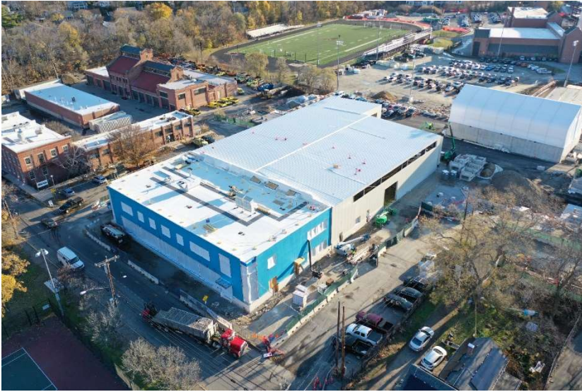
Site overview – new Building E in late 2022