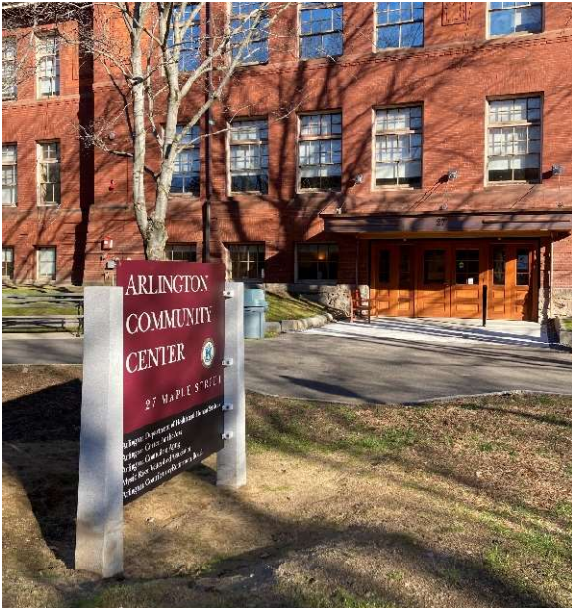
Maple Street main entrance – new sign, entry, canopy