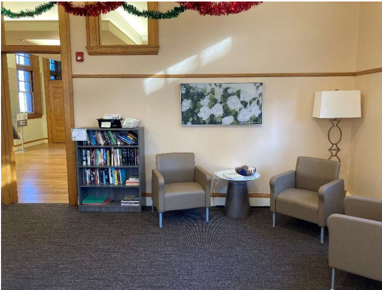
Drop-in room – first floor