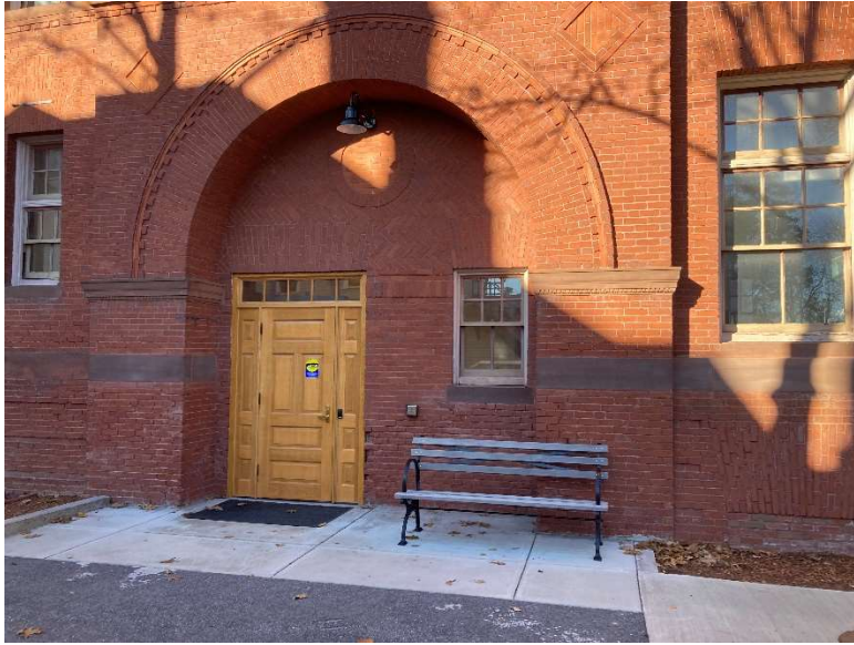
New East entry with accessible door controls