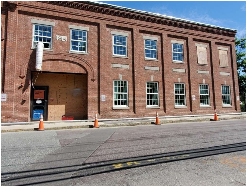
Building A exterior, showing new windows and disconnected cooling duct