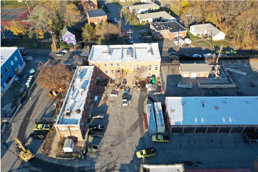
Site overview – Bldg A (on Grove Street), Bldg B (left side), Bldg C (right side)