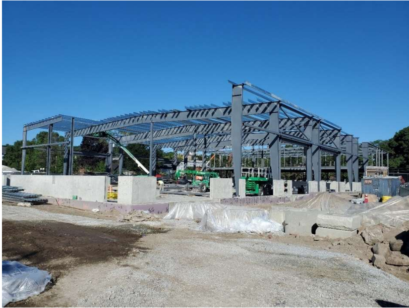
Building E steel erection