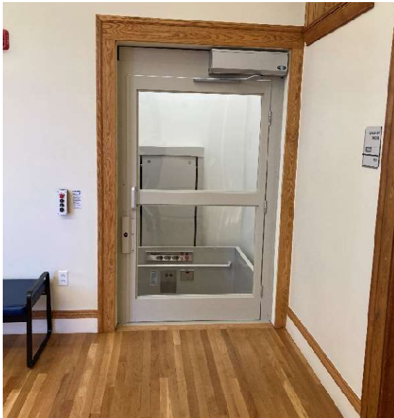
New accessible lift connecting East entry with ground and first floors