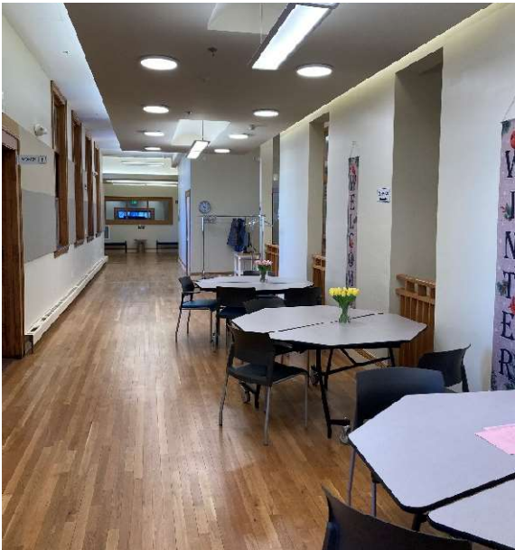
Main corridor, first floor