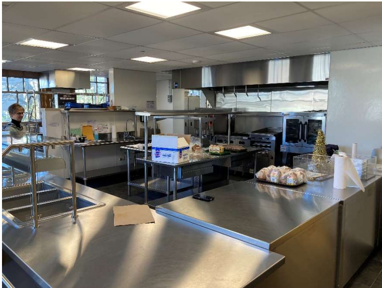
New kitchen, first floor