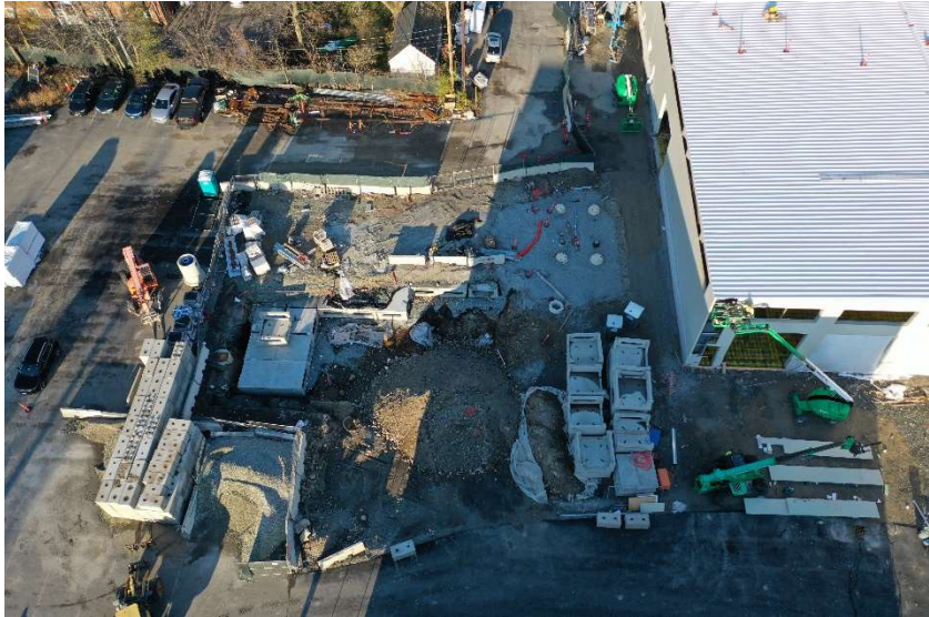
Discovery of large retaining tank adjacent to Building E