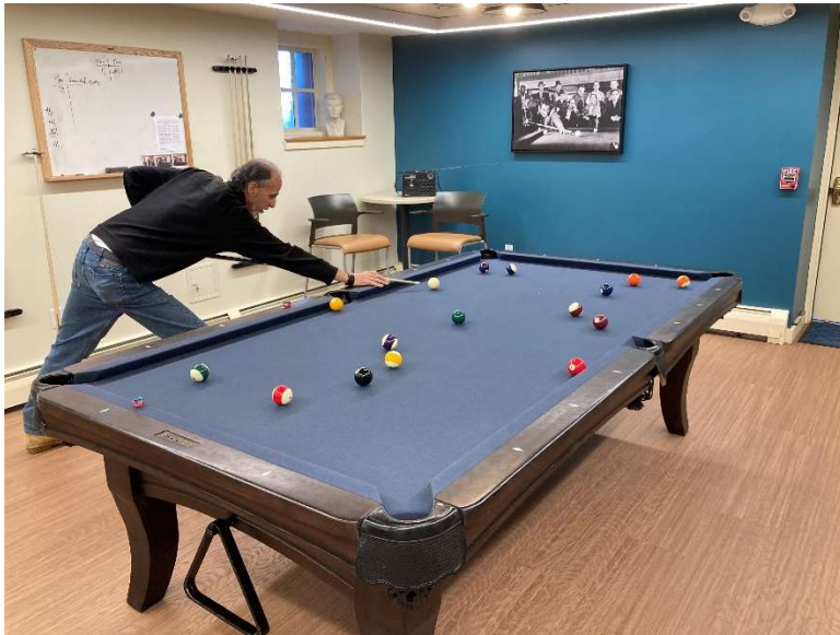
Pool room – first floor