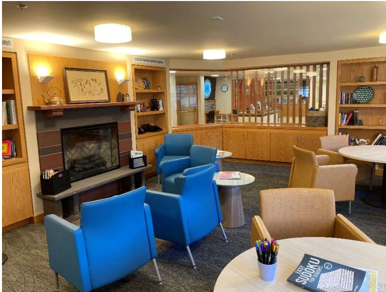
Library – ground floor