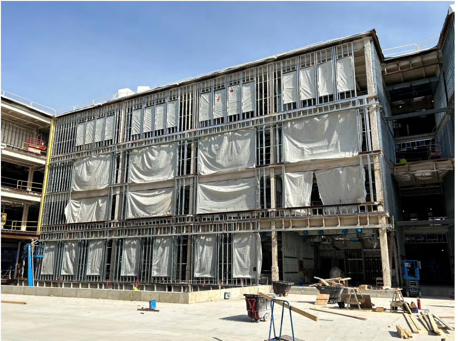
Exterior Window Framing Progress

WEEKLY UPDATE – WEEK OF MAY 15 TH , 2023