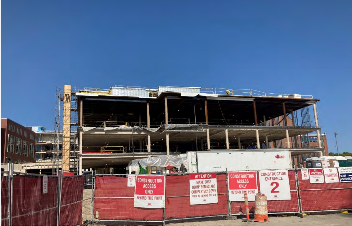
Phase 2 East Elevation (Millbrook Dr)