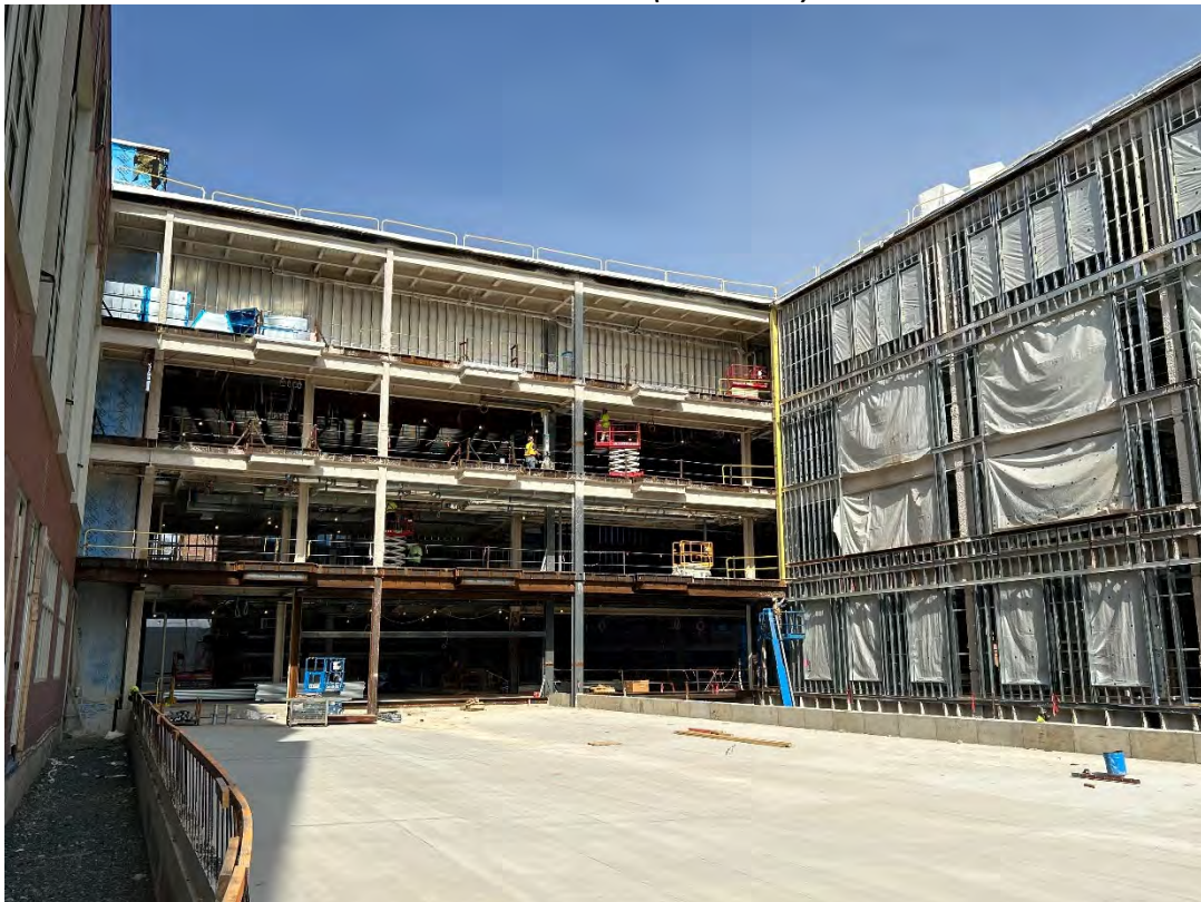
Outdoor Classroom Courtyard progress (Phase 1 & 2 connection)