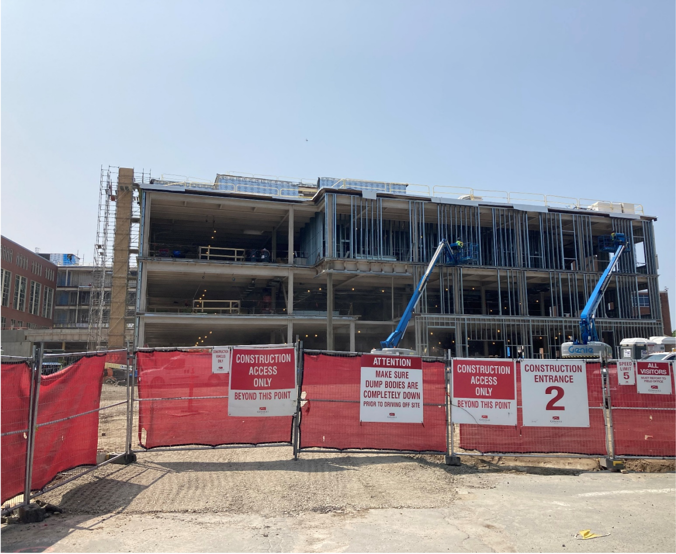
View from Mill Brook Drive