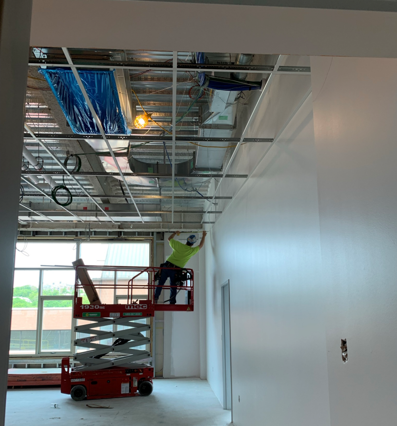
Drywall taping and sanding complete and painting progressing