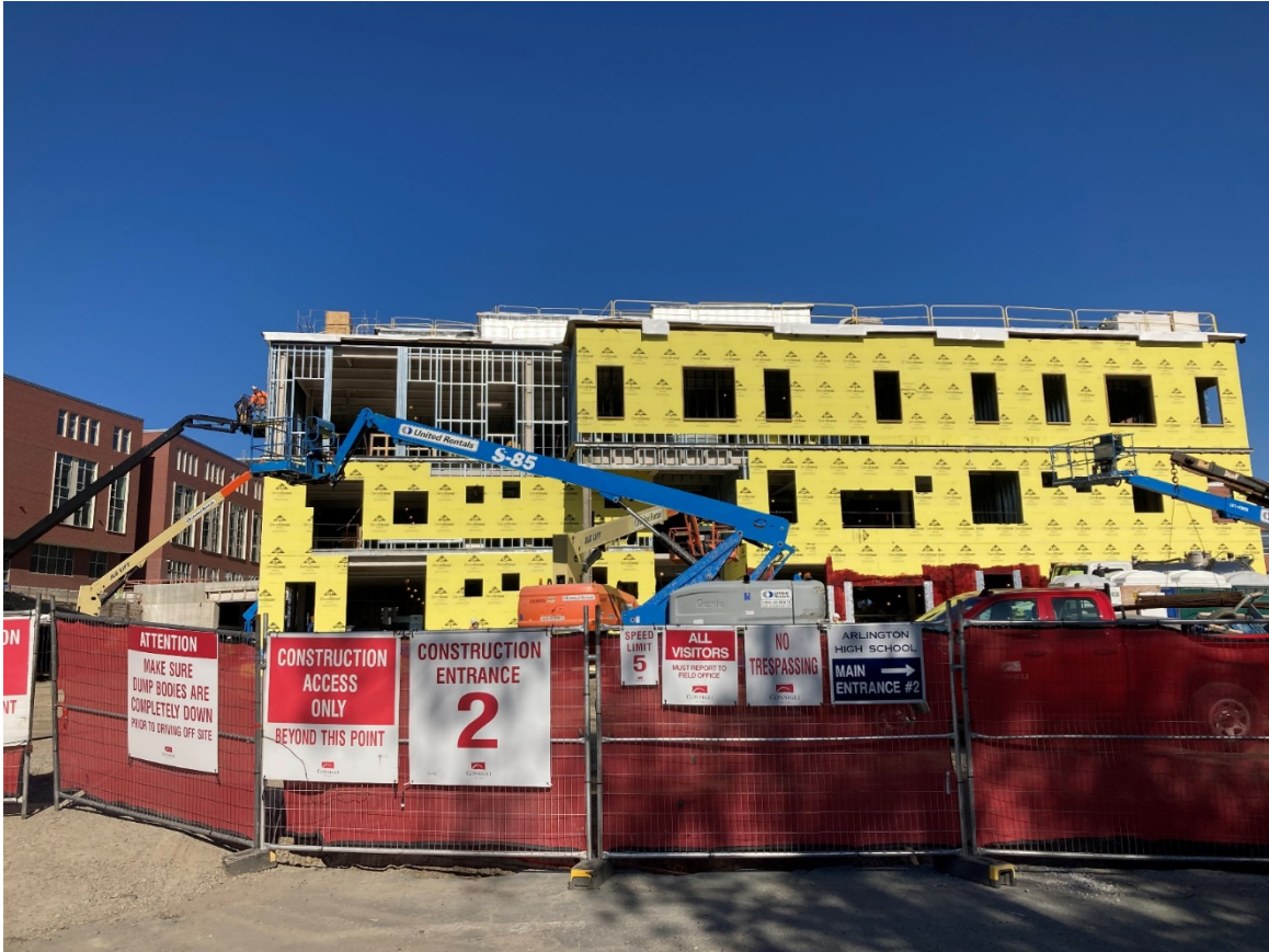
Phase 2 East Elevation (Millbrook Dr)