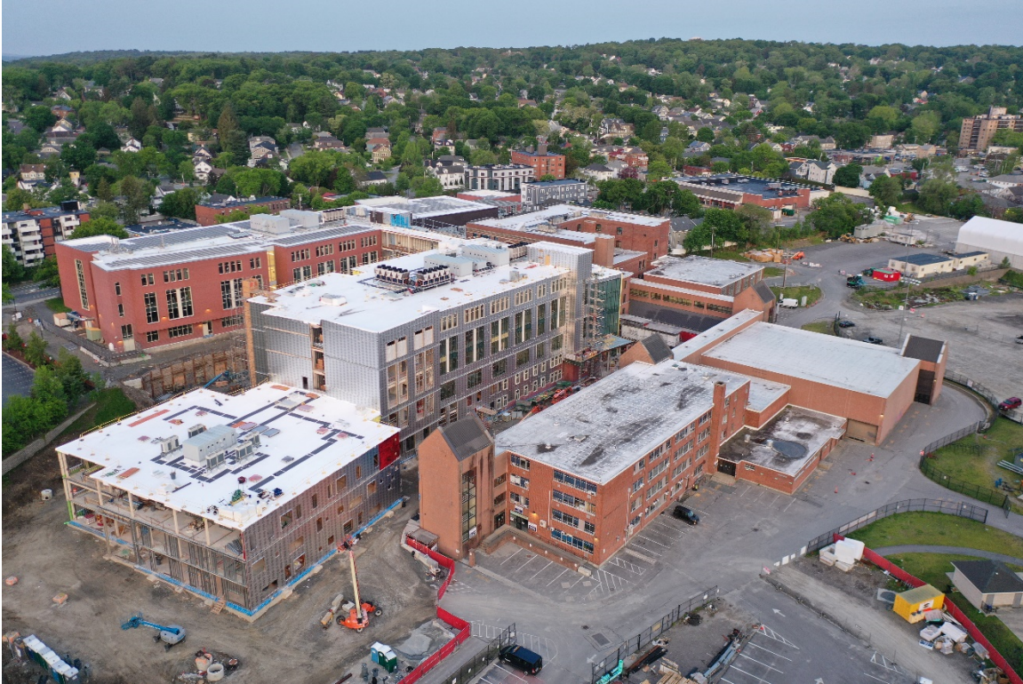
Drone Progress Photo