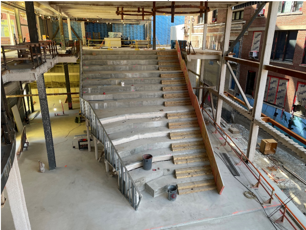
Forum Stair Progress