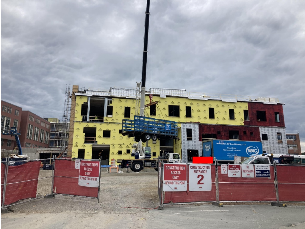
Phase 2 East Elevation (Millbrook Dr)