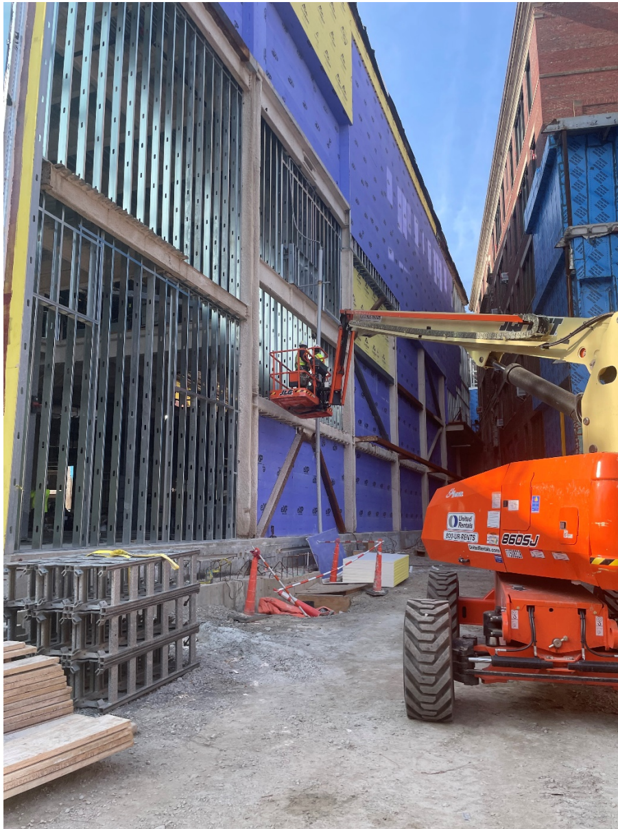
Exterior Framing Progress