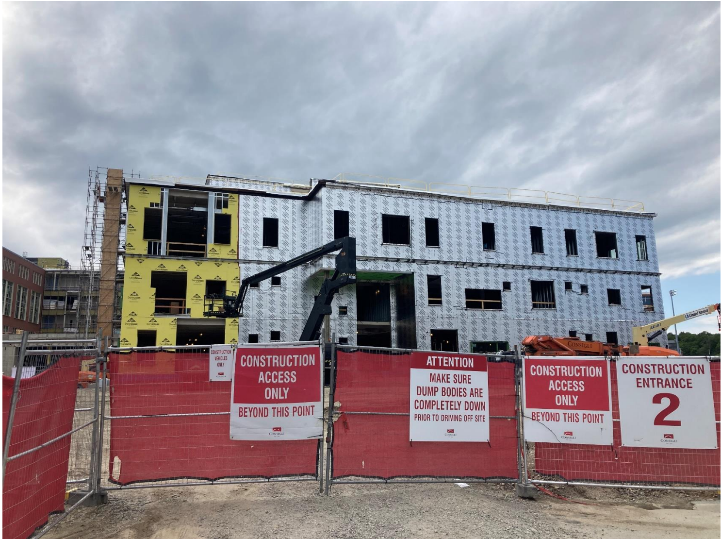
Photograph 2: Phase 2 East Elevation (Mill Brook Dr)

WEEKLY UPDATE – WEEK OF JUNE 26 TH , 2023