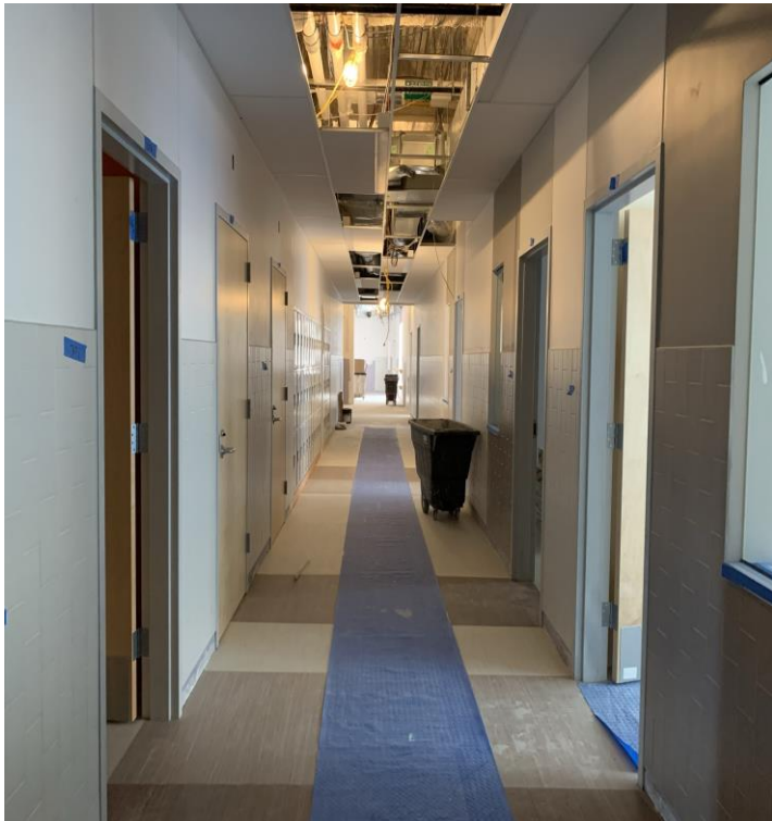
Photograph 2: Level 3 Corridor Halls