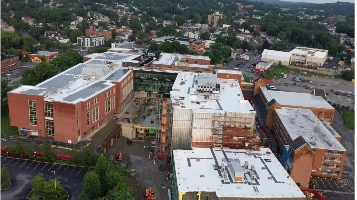
Photograph 4: Drone footage of progress of Building B and Building C

WEEKLY UPDATE – WEEK OF AUGUST 7 TH , 2023