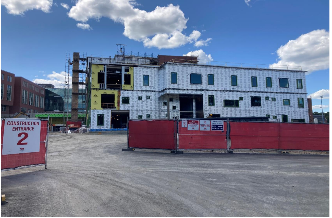
Photograph 1: Phase 2 East Elevation (Mill Brook Dr)