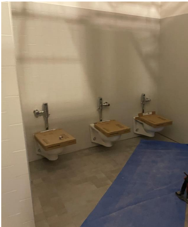
Photograph 2: Plumbing Fixtures