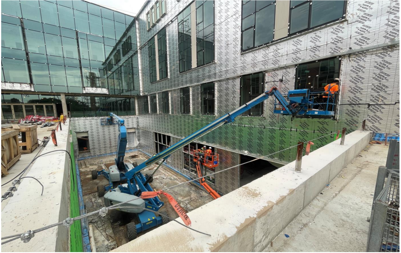
Photograph 1: Phase 2 Courtyard area curtainwall install