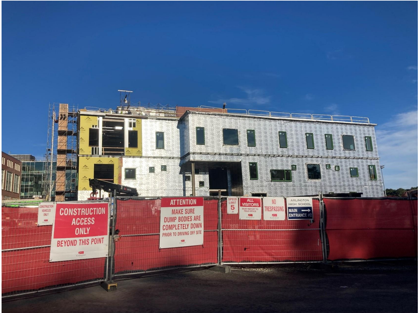
Photograph 4: Phase 2 East Elevation (Mill Brook Dr)

WEEKLY UPDATE – WEEK OF AUGUST 14 TH , 2023