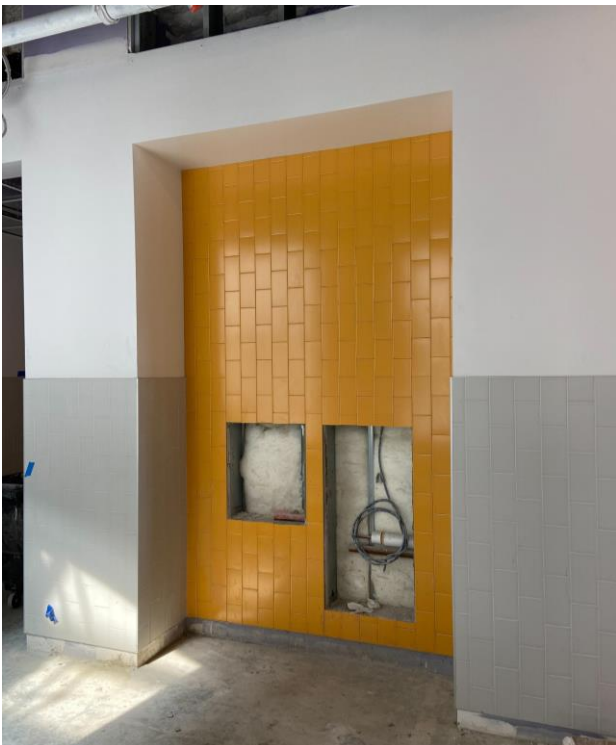
Photograph 2: Accent Tile outside Corridor Bathrooms