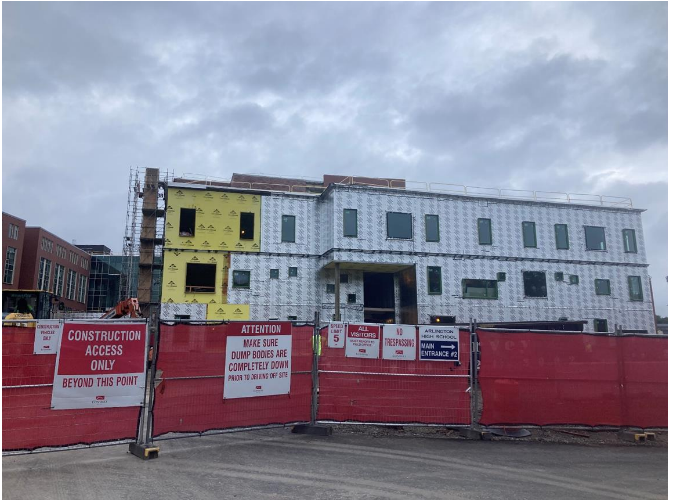
Photograph 4: Phase 2 East Elevation (Mill Brook Dr)