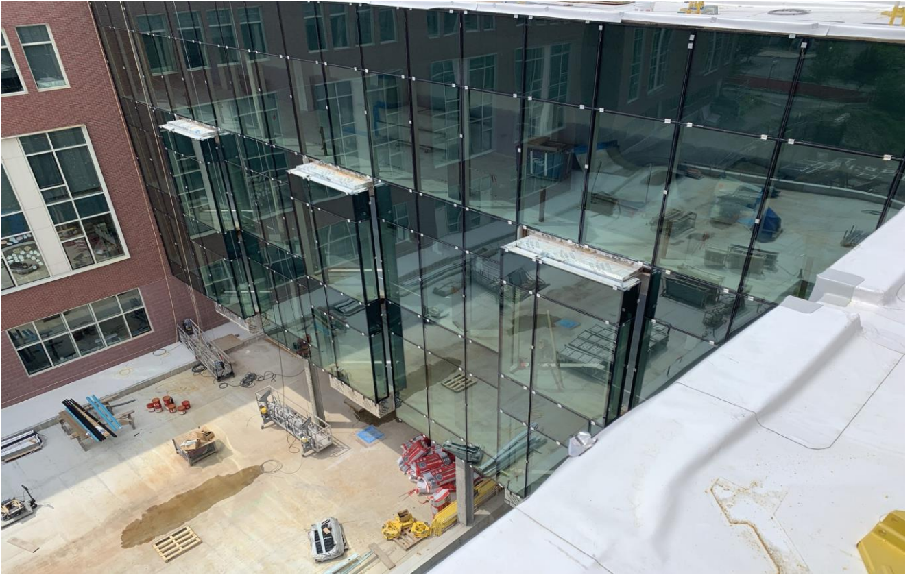
Photograph 1: Phase 2 Courtyard area curtainwall install

WEEKLY UPDATE – WEEK OF AUGUST 21 ST , 2023