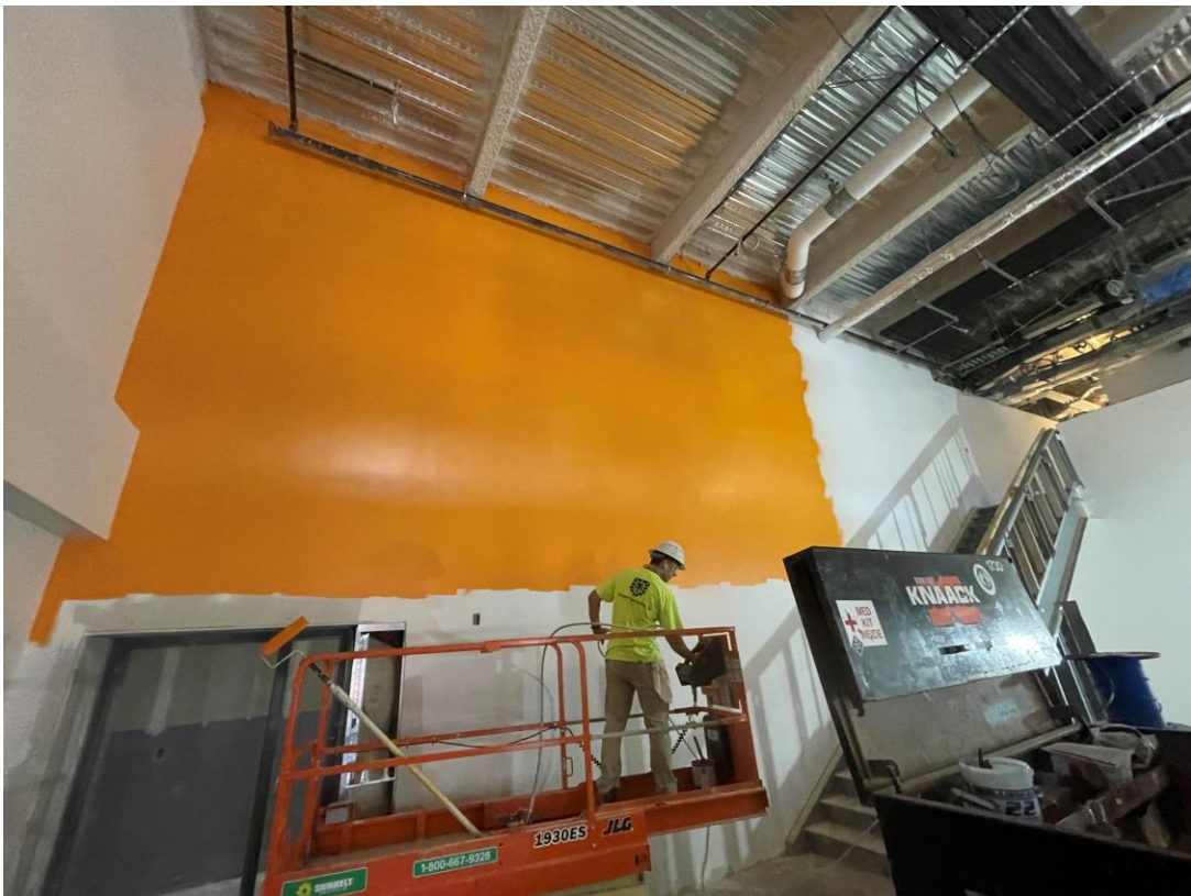
Photograph 2: Progress of Building C Guidance area.