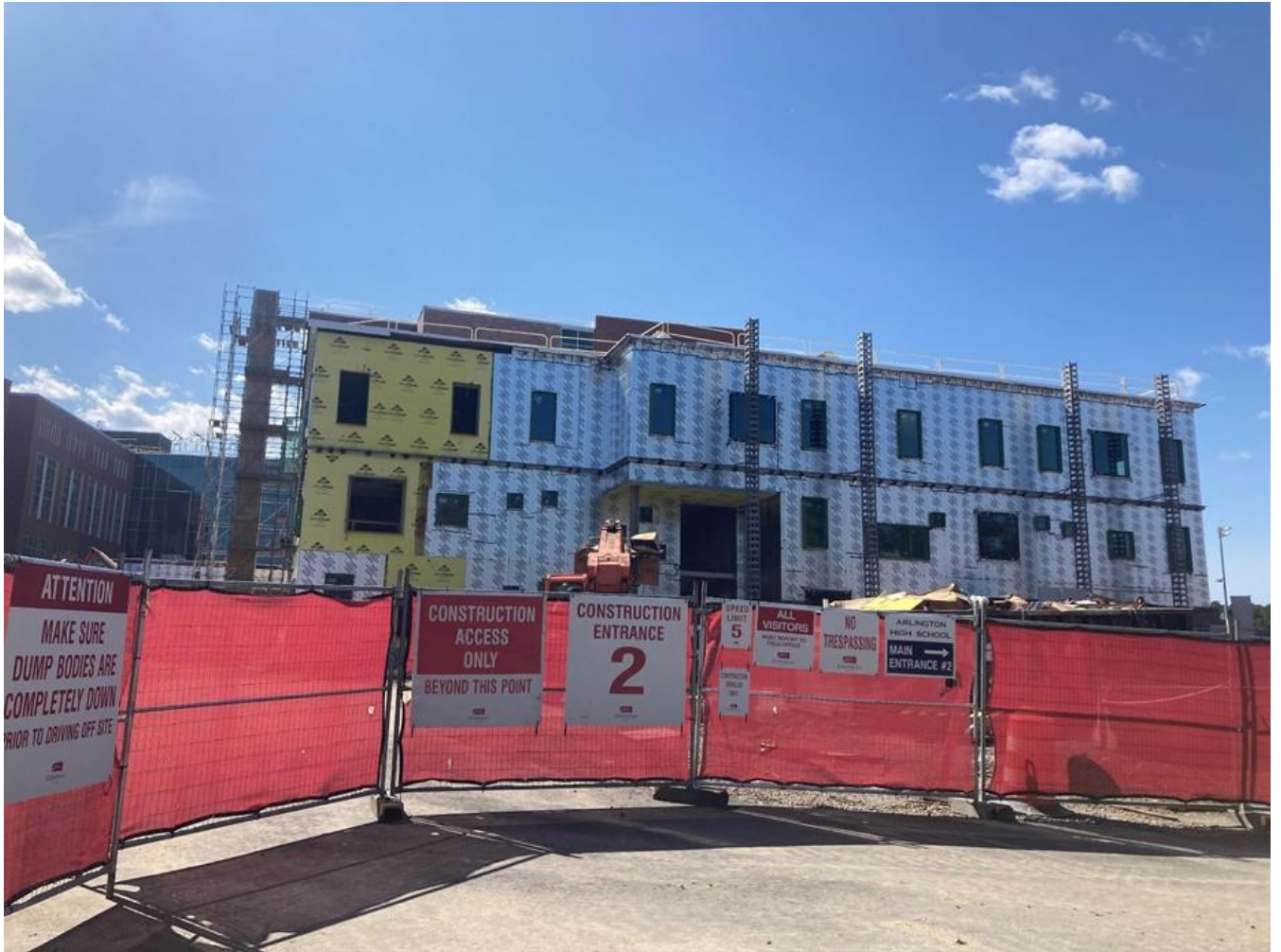
Photograph 4: Phase 2 East Elevation (Mill Brook Dr)

WEEKLY UPDATE – WEEK OF AUGUST 28 TH , 2023