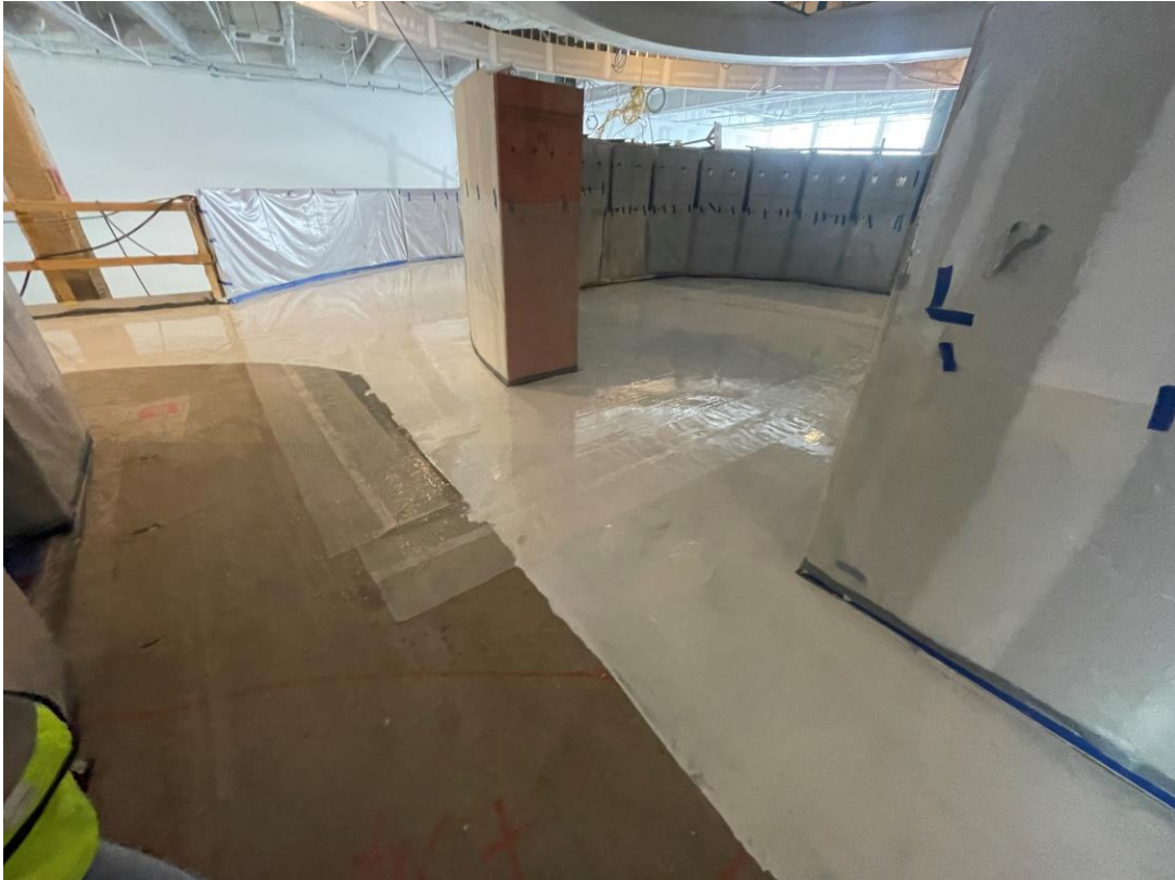
Photograph 1: Progress of flooring at corridor locker pods.