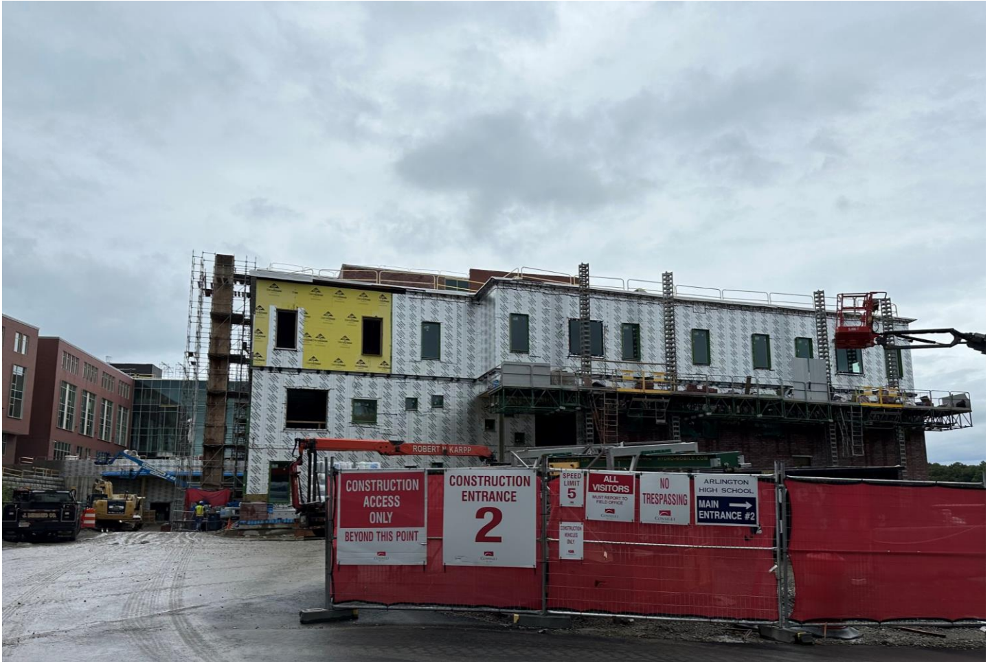
Photograph 1: Phase 2 East Elevation (Mill Brook Dr)