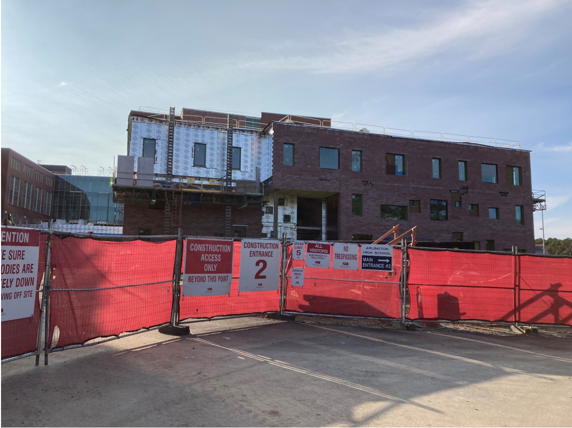
Photograph 1: Phase 2 East Elevation (Mill Brook Dr)