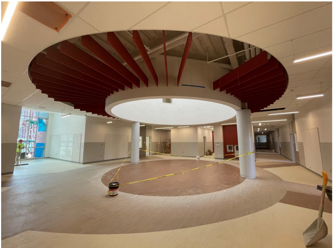
Photograph 2: Level 2 Corridor Progress