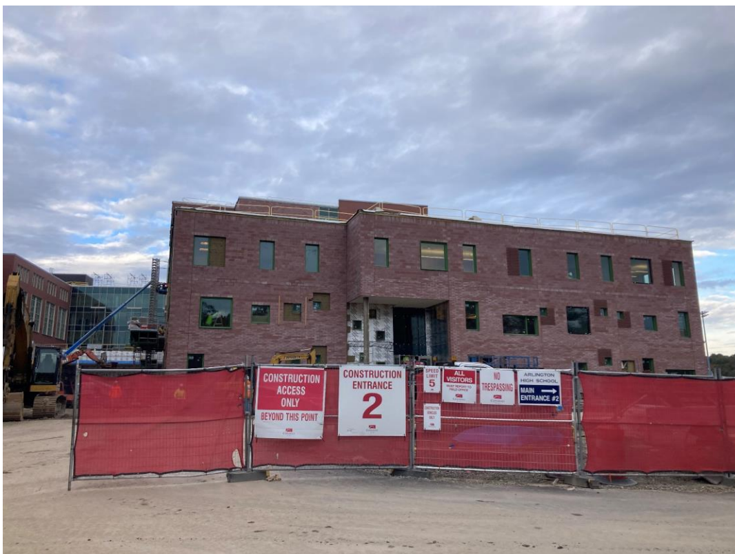
Photograph 4: East Elevation (Mill Brook Dr)