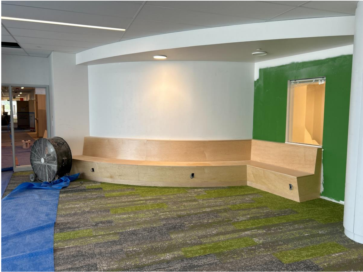
Photograph 1: Library Millwork Progress