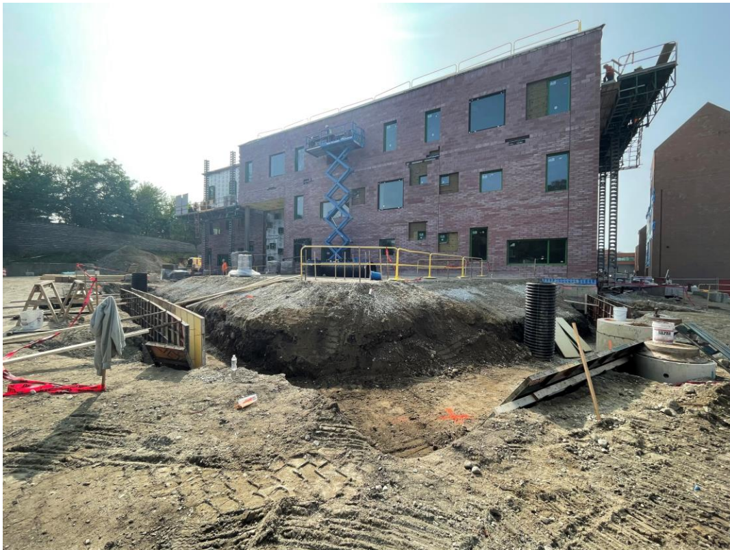
Photograph 3: Playground Sitework Progress