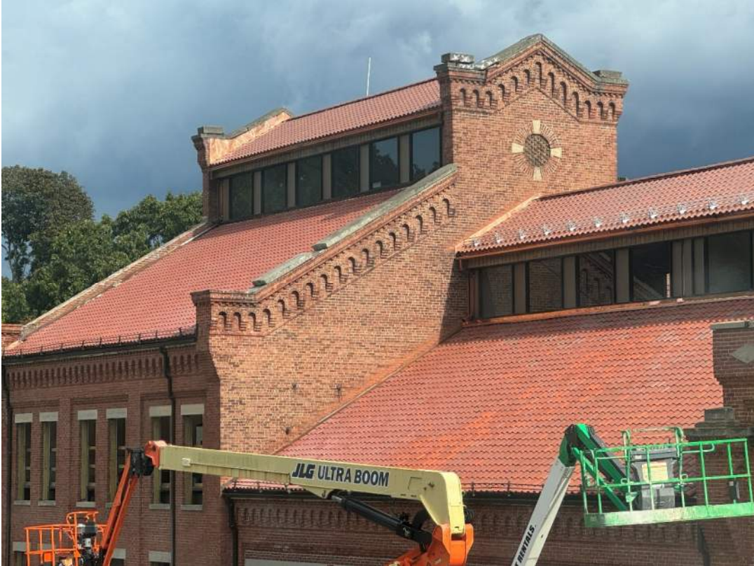
Photo #3 – Building D Exterior Flashing/Repointing in Progress (10/10/23)