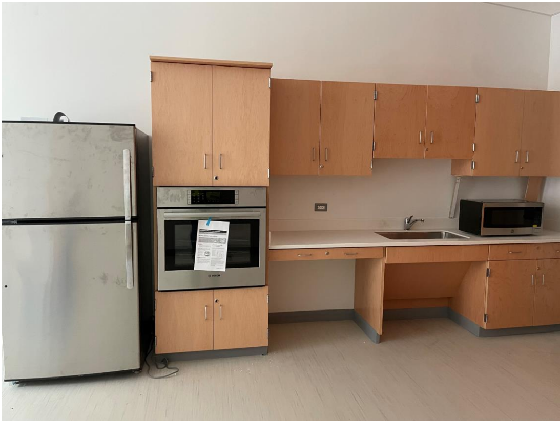
Photograph 1: Progress of appliance install.