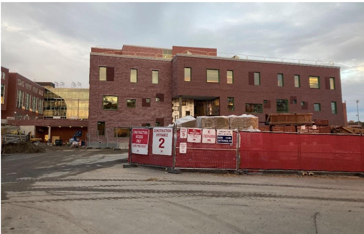
Photograph 2: East Elevation (Mill Brook Dr)