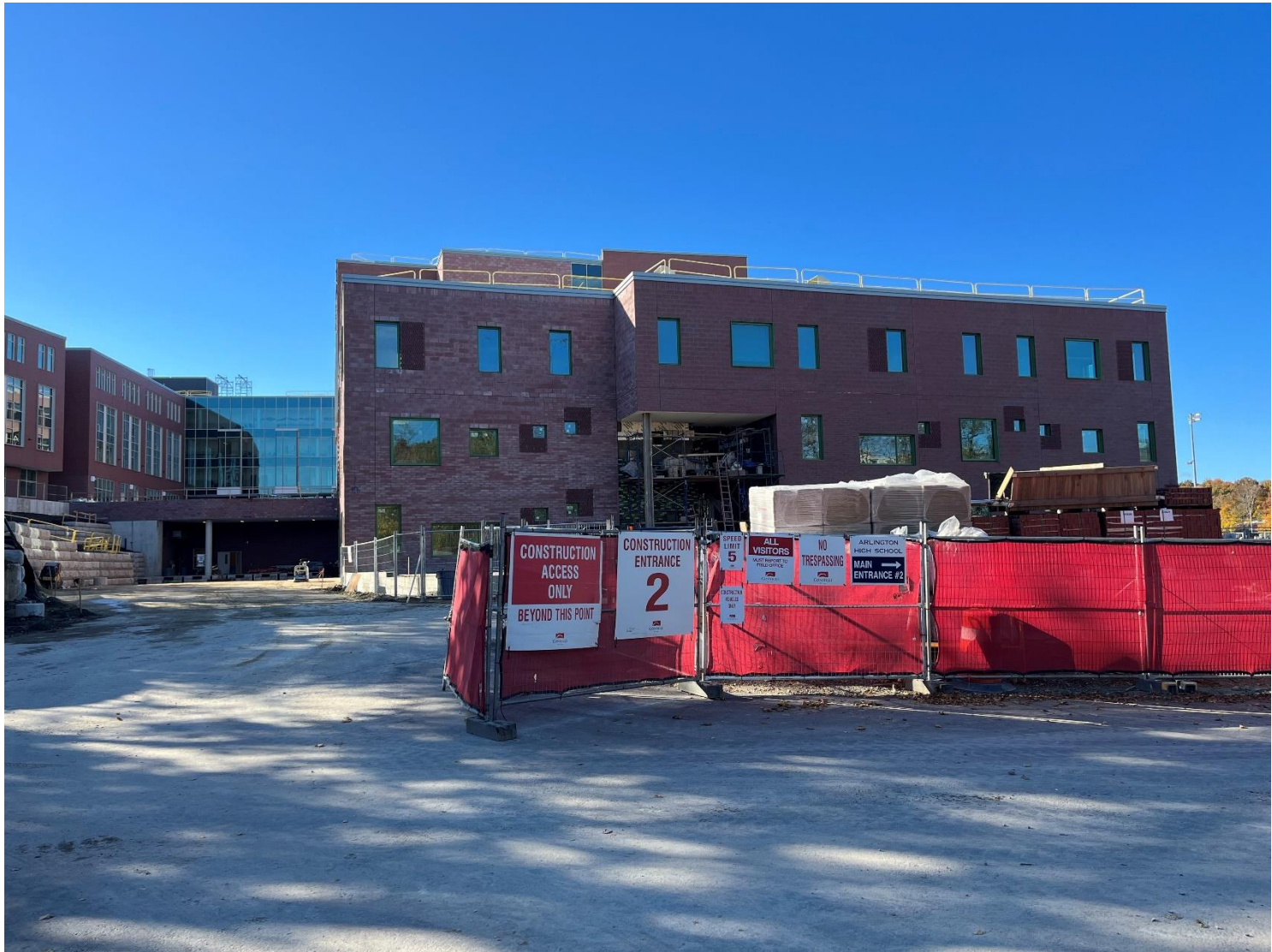
Photograph 1: East Elevation (Mill Brook Dr)

WEEKLY UPDATE – WEEK OF NOVEMBER 6 TH , 2023