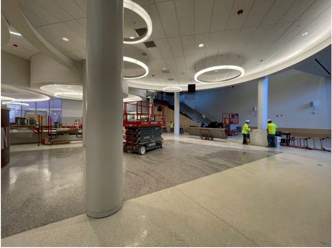
Photograph 1: Final Clean of Cafeteria Area