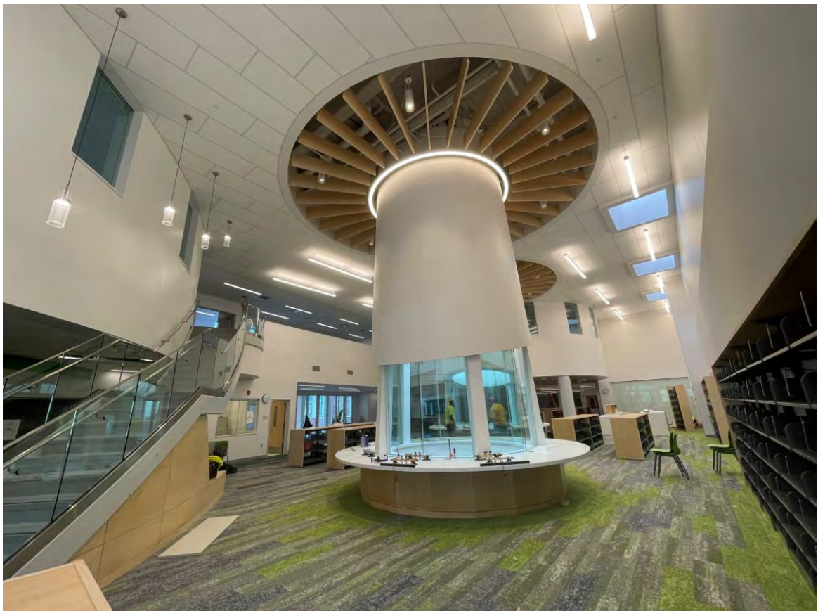
Photograph 2: Library