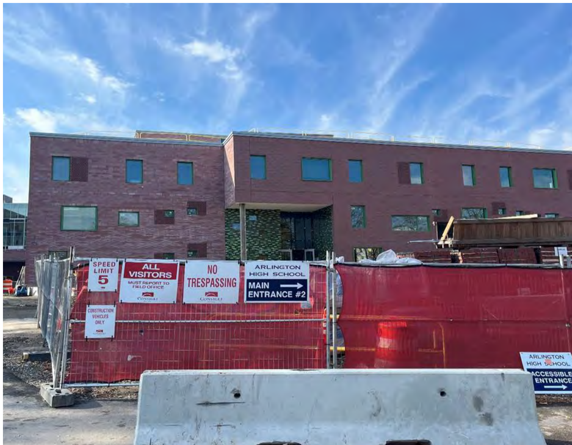
Photograph 4: East Elevation (Mill Brook Dr)