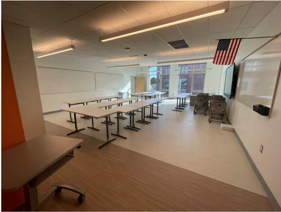
Photograph 3: Classroom Furniture Delivery

WEEKLY UPDATE – WEEK OF NOVEMBER 13 TH , 2023