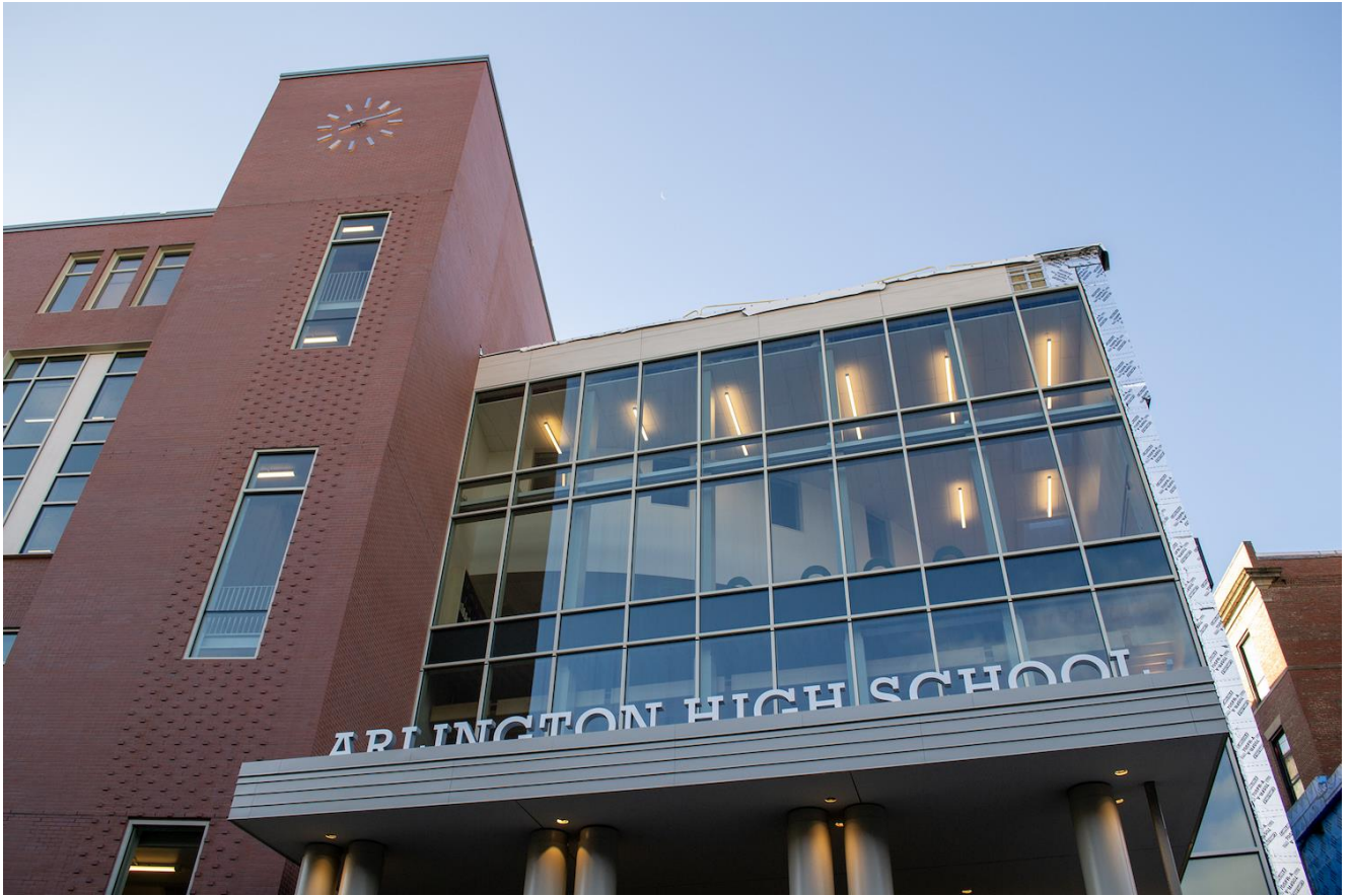
Photograph 3: North Entry

WEEKLY UPDATE – WEEK OF NOVEMBER 27 TH , 2023