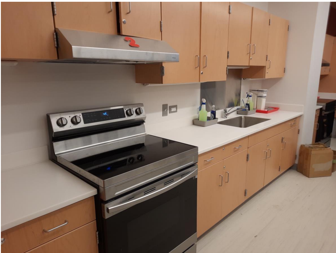
Photograph 2: FACS room