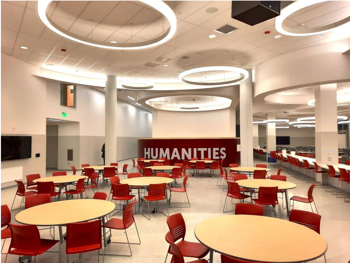
Photograph 1: Cafeteria