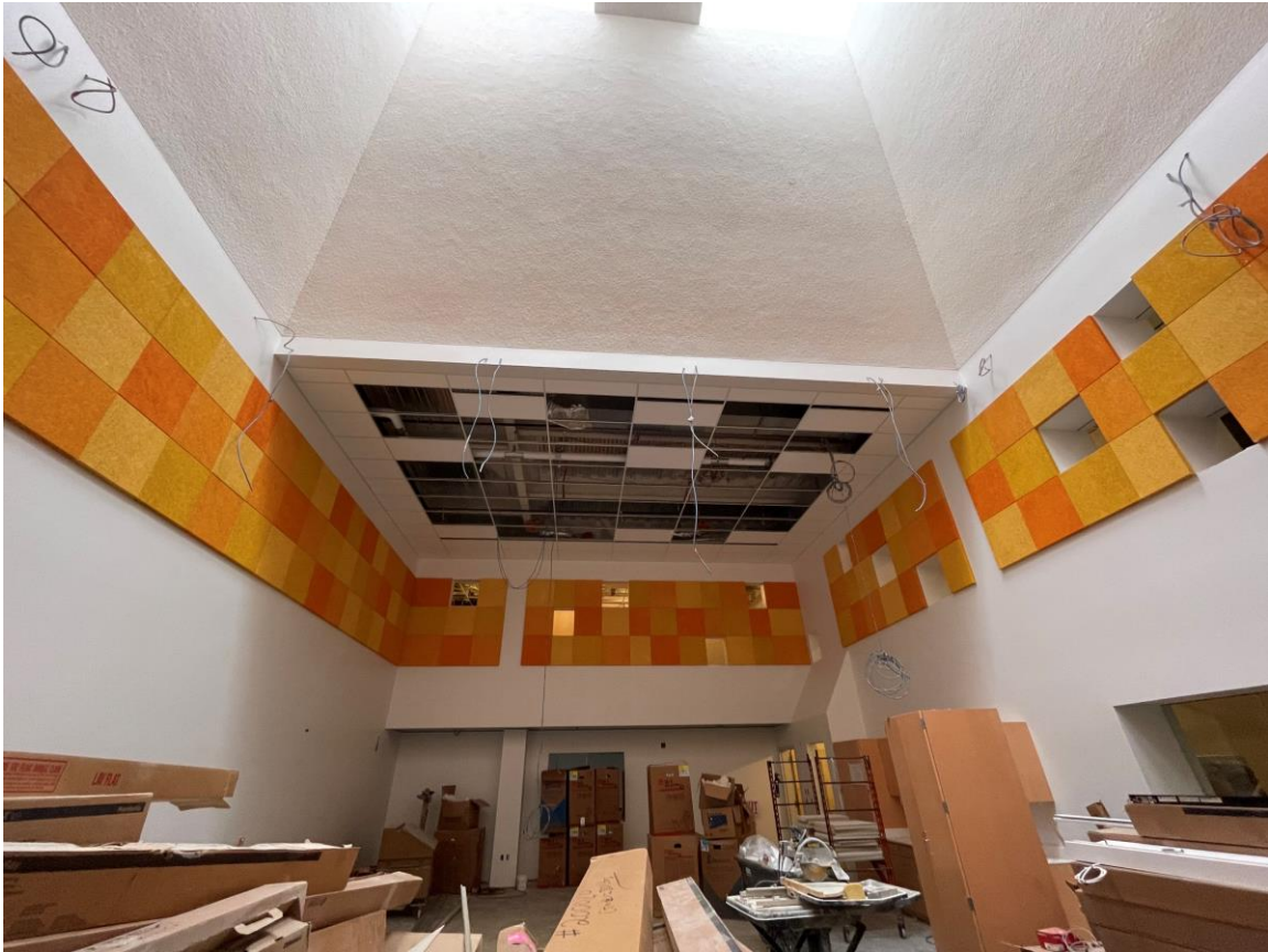
Photograph 1: Pre-School Multipurpose Room