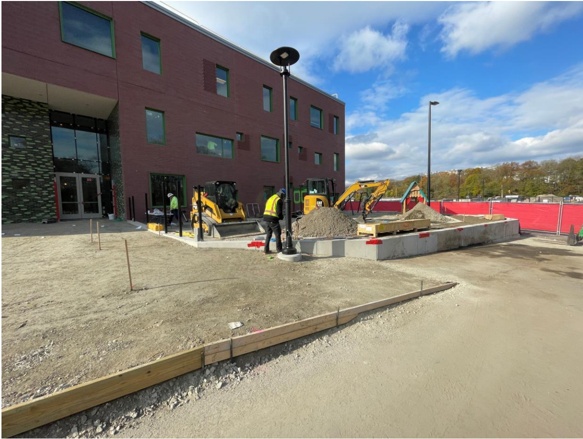
Photograph 3: Pre-School and Daycare sitework progress