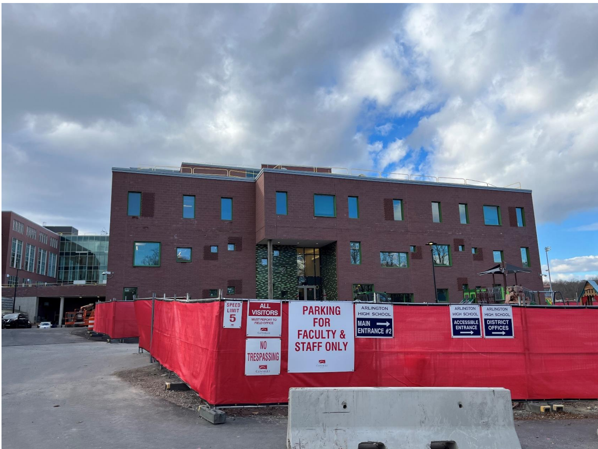
Photograph 4: East Elevation (Mill Brook Dr)