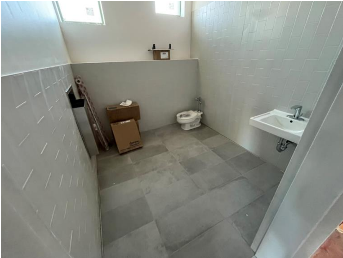
Photograph 3: Pre-School and Daycare bathroom fixtures progress.