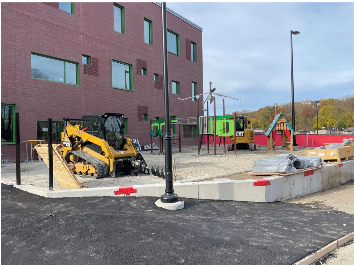
Photograph 2: Pre-School Playground structure progress.