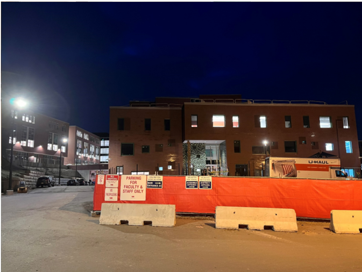
Photograph 4: Phase 2 East Elevation (Mill Brook Dr).