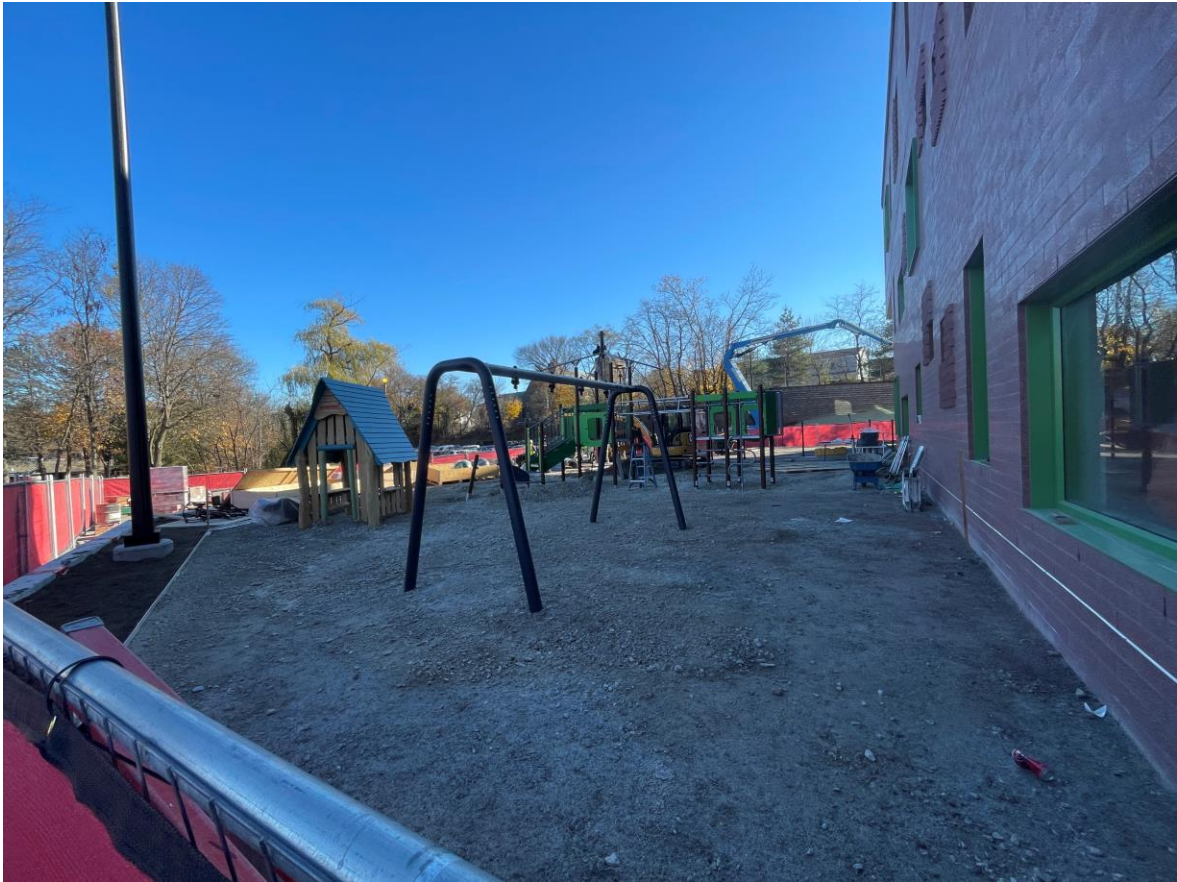
Photograph 1: Pre-School Playground structure progress.