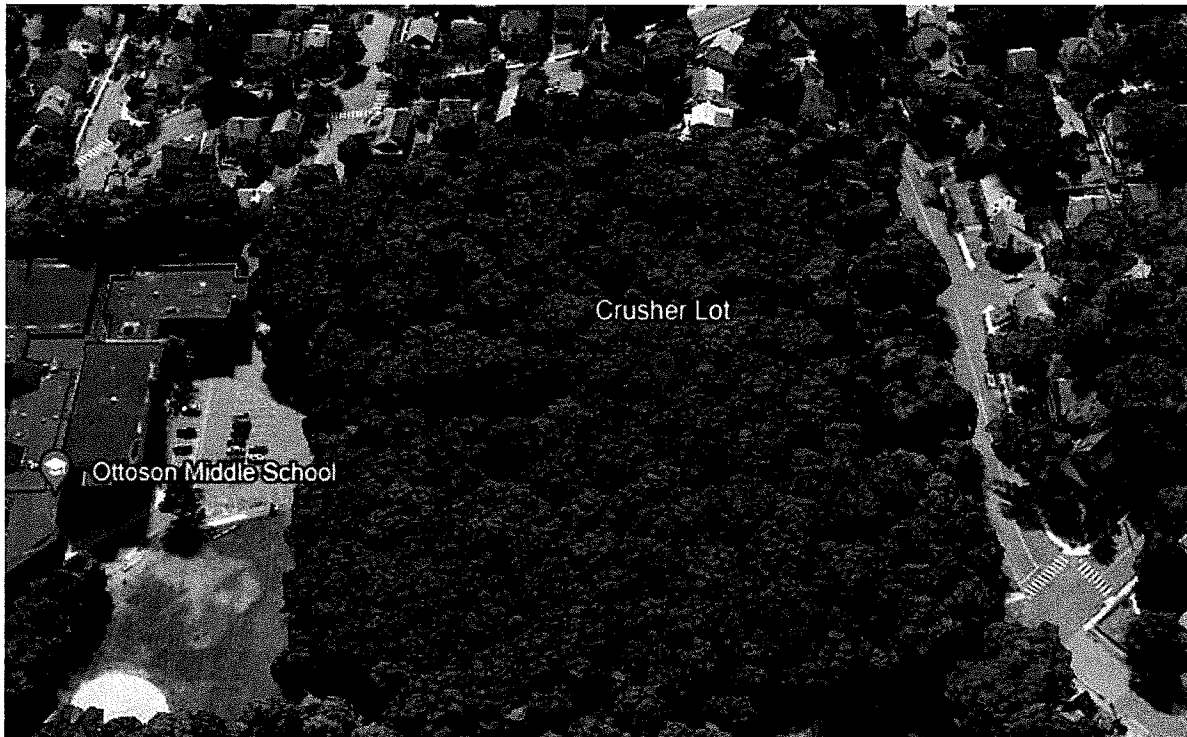
Crusher Lot is a small wooded urban area with trails located behind Ottoson Middle School.

Thank you for contacting Davey Resource Group, Inc. “DRG” regarding tree inventory services. In support of your objective to inventory the urban woodlot trees in Crusher Lot, DRG is pleased to present a pricing estimate for a tree inventory of the ~4–5 acre wooded area behind Ottoson Middle School in Arlington, MA. Through DRG and our dedicated team of arboricultural specialists, you will be assured of quality arborist services and professional assessments to help you achieve your long-term goals.