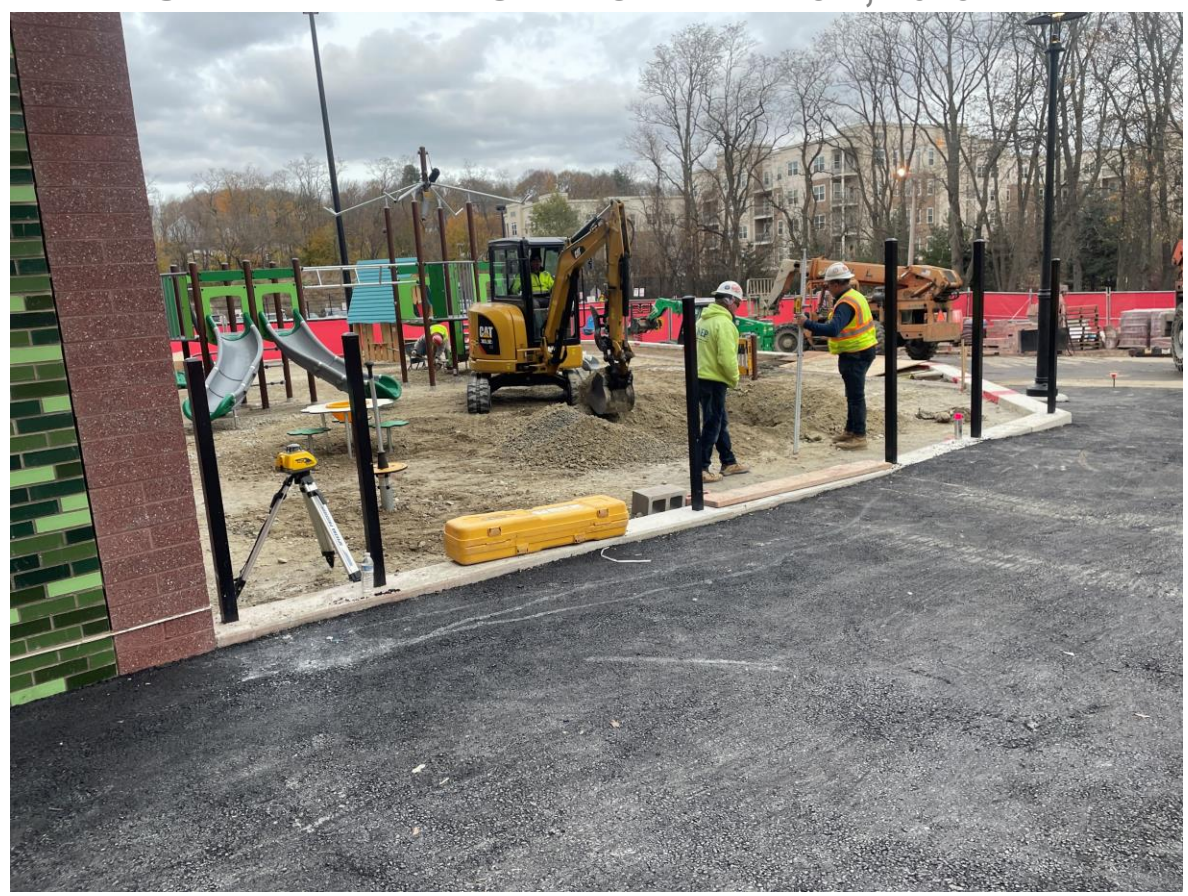
Photograph 1: Pre-School Playground fence post installation.