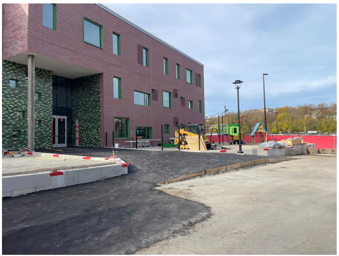
Photograph 2: East Entrance pavement progress.