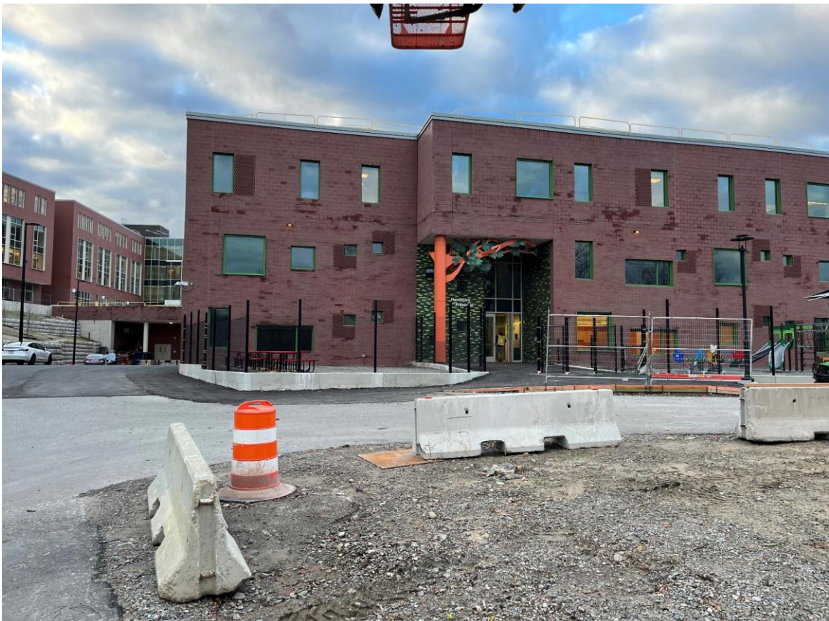
Photograph 4: East Elevation (Mill Brook Dr)