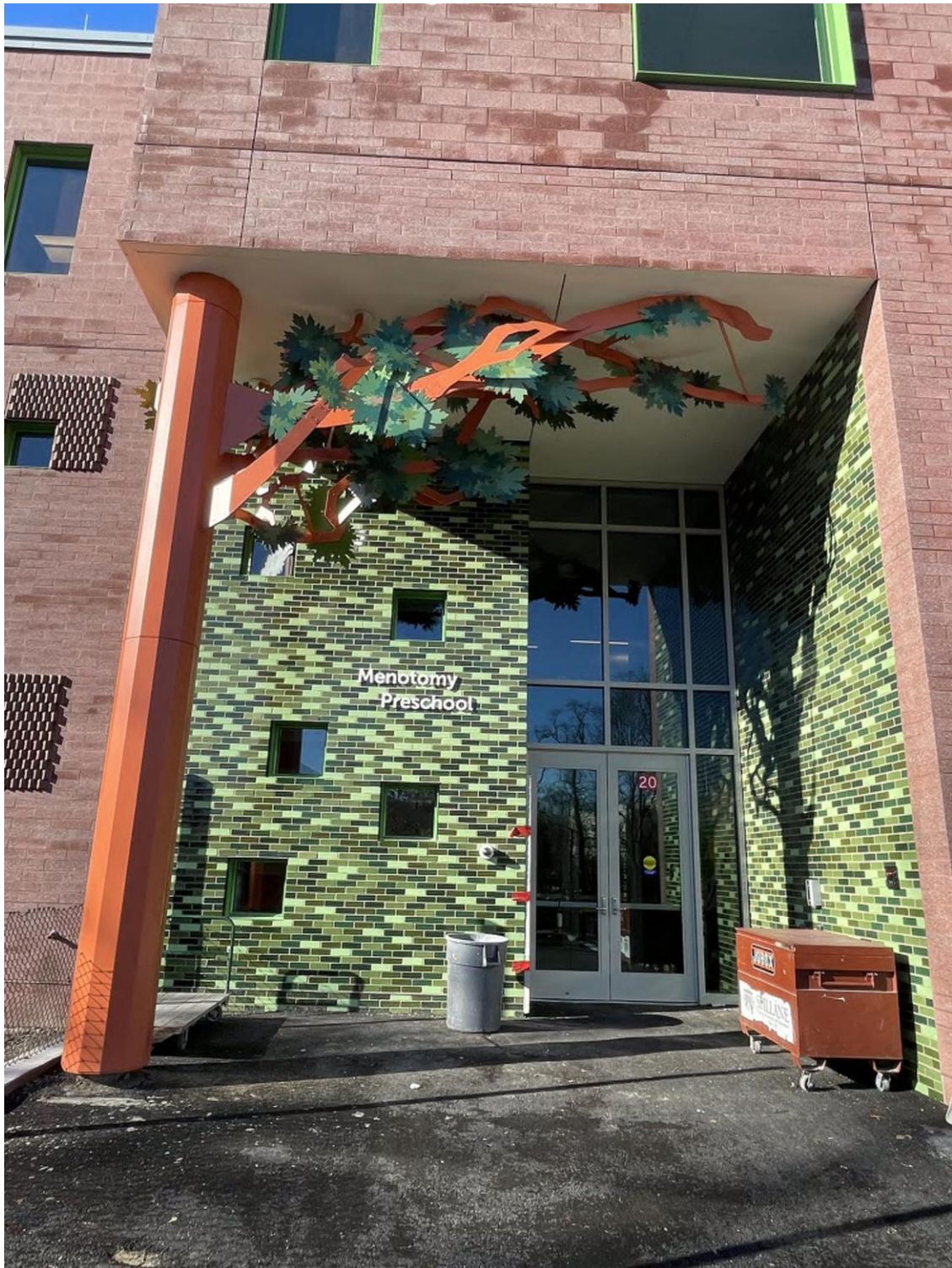
Photograph 1: Menotomy Preschool Entrance.