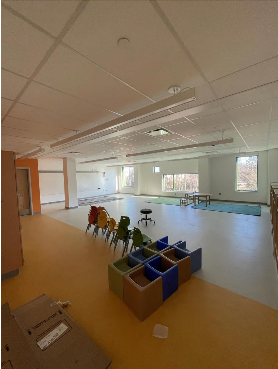
Photograph 2: Preschool Furniture Delivery Progress