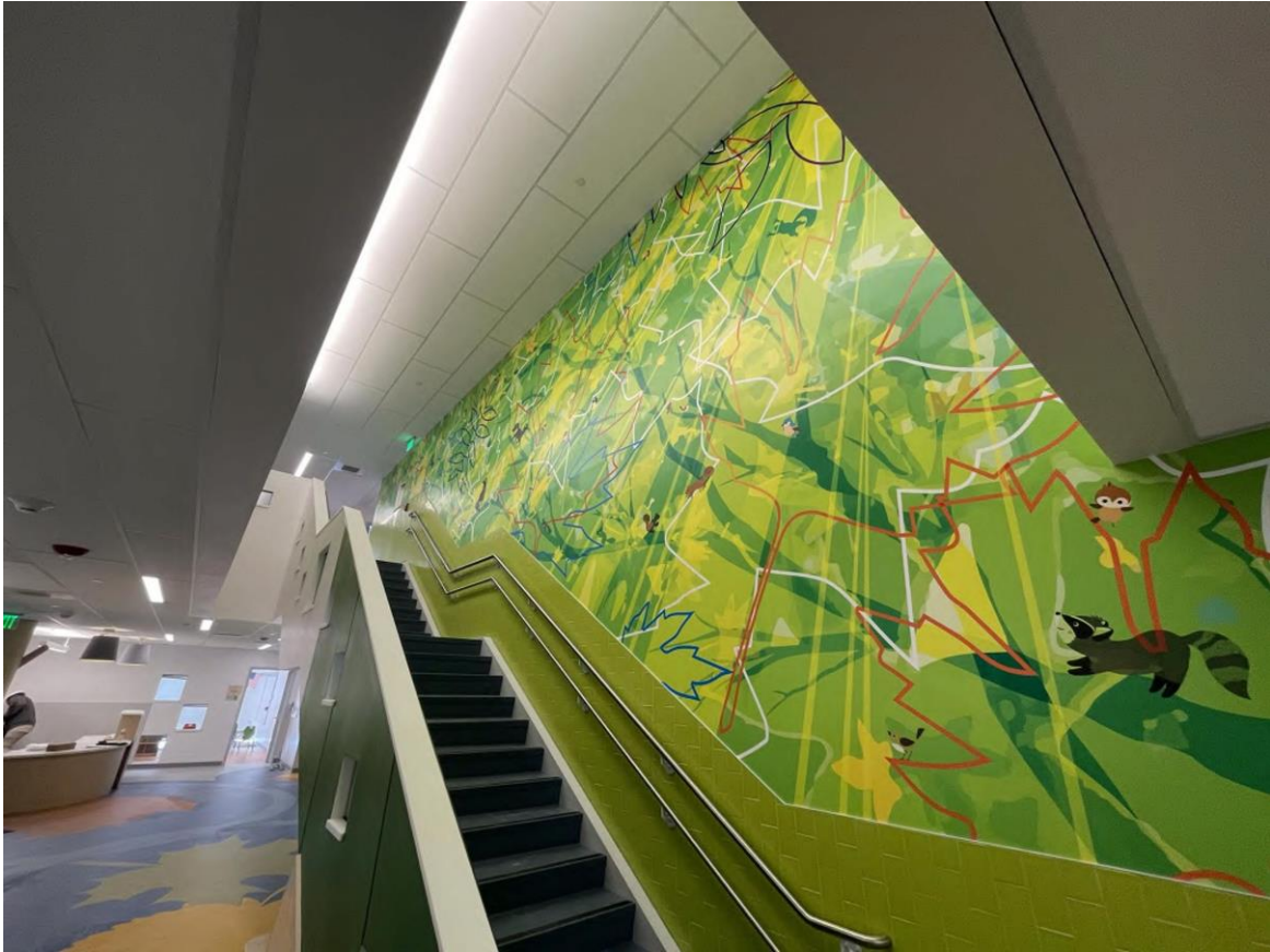
Photograph 3: Menotomy Stair Graphic Progress