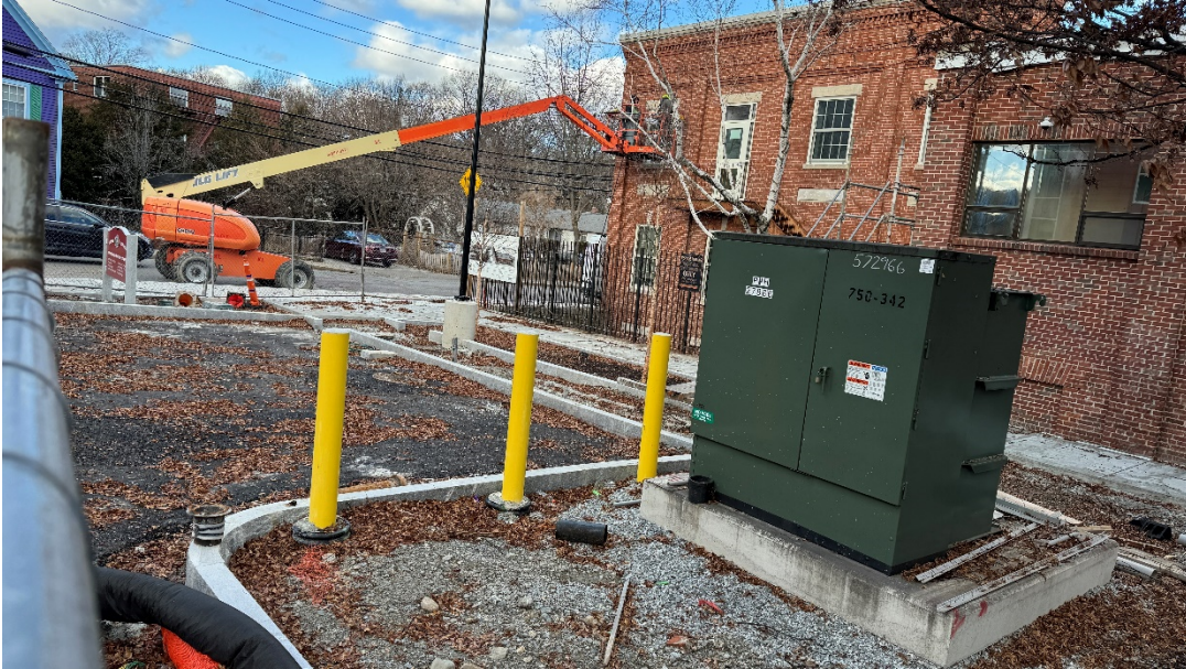
Photo #3 - Sitework - Concrete Sidewalks and Electrical Charging Stations (12/12/23)