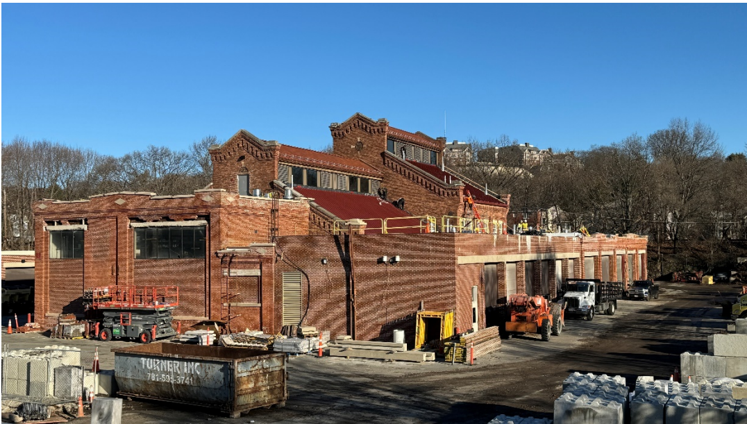
Photo #6 - Building D - Precast Cap and Masonry Repointing in Progress (12/19/23)