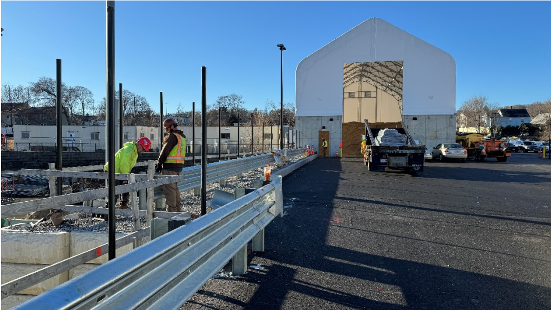
Photo #1 - Upper Site Retaining Wall Fence in Progress, Guardrail Complete (12/19/23)