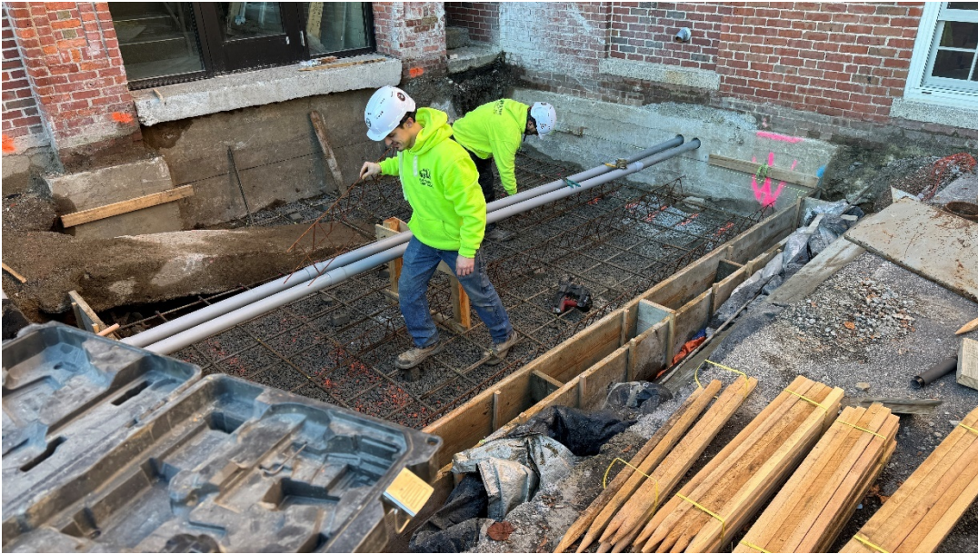
Photo #2 - Building B Foundation at Connector in Progress (12/12/23)