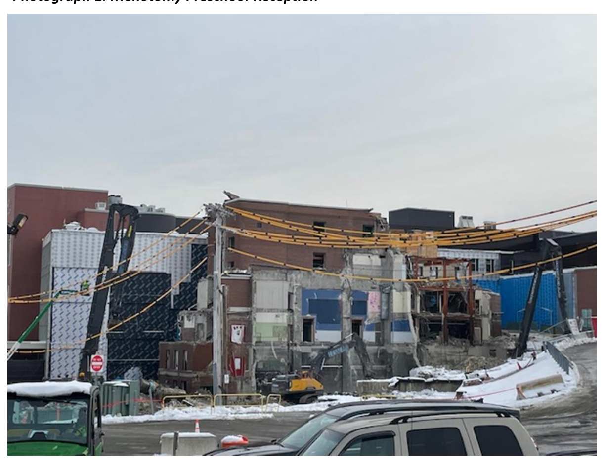
Photograph 2: Progress of Fusco demolition