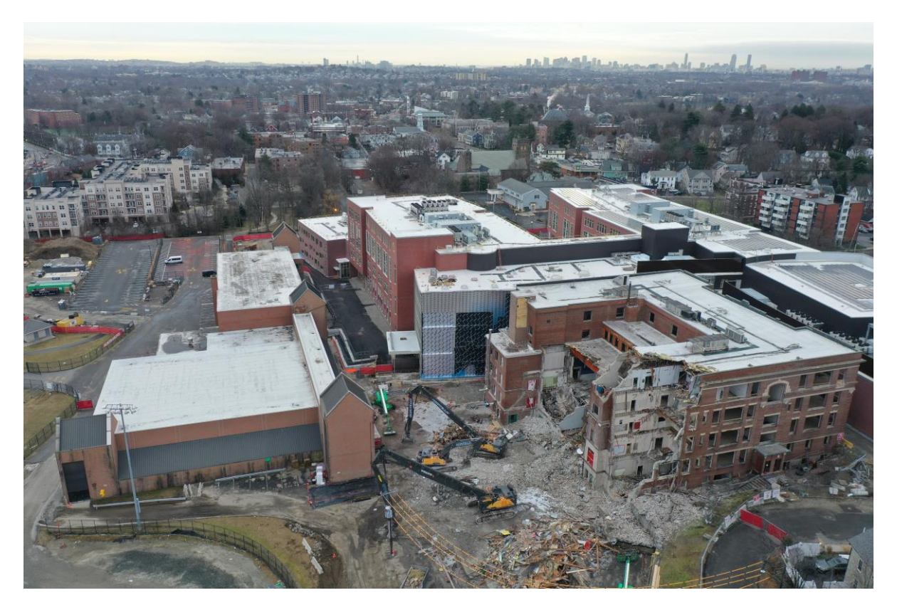
Photograph 3: Aerial view