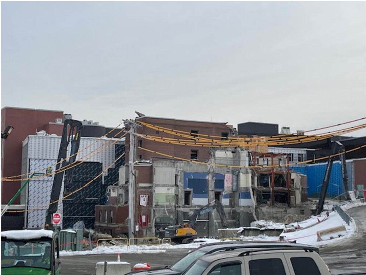
Photograph 2: Progress of Fusco demolition