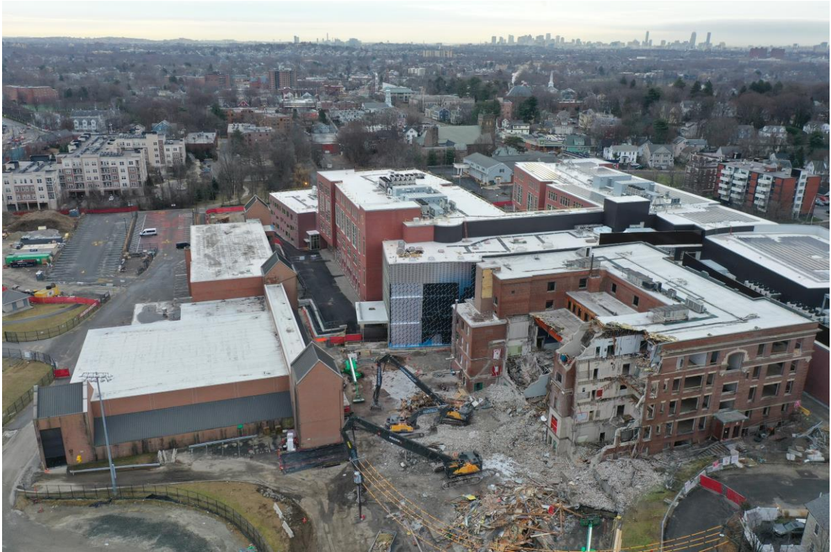
Photograph 3: Aerial view