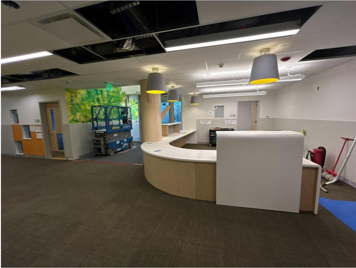
Photograph 1: Menotomy Preschool Reception