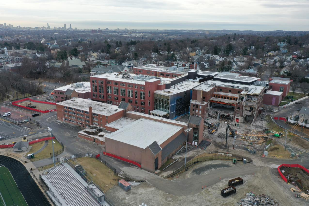
Photograph 1: Aerial View