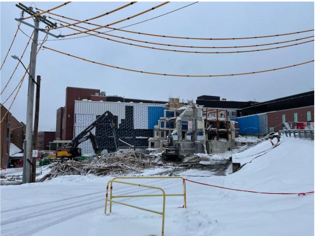
Photograph 2: Phase 3 West Elevation (Schouler Ct)