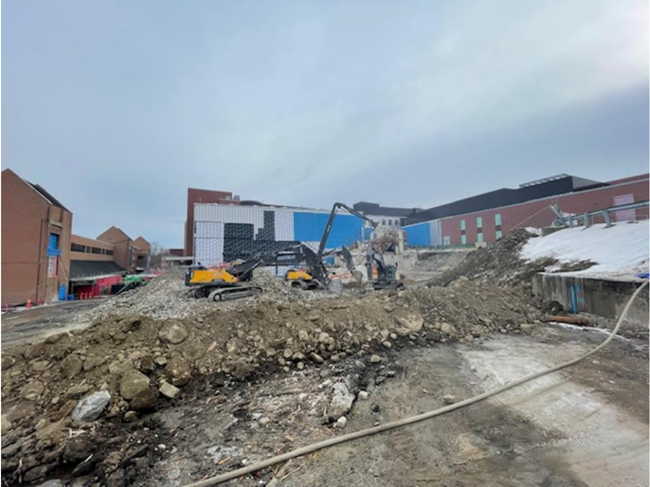
Photograph 2: Phase 3 West Elevation (Schouler Ct)

WEEKLY UPDATE – WEEK OF JANUARY 29 TH , 2024